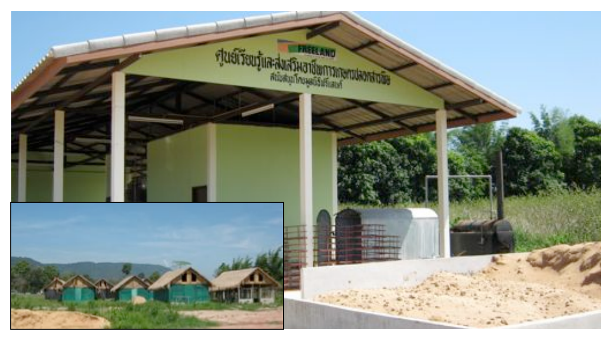
The partially outfitted Training, Wholesale and Processing Center (inset: mushroom barns)

The pilot program in the flagship Kok Sa-ard Village has so far helped seven ex-poacher households establish sustainable and growing mushroom farming businesses. These businesses supply the FREELAND Organics wholesale arm (which currently delivers all profits from sales to growers).