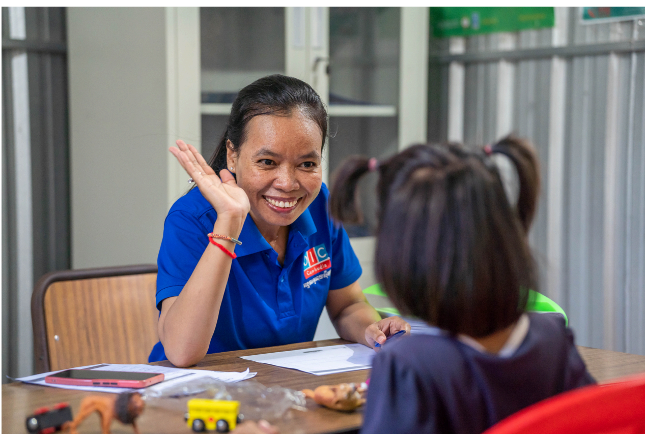
Support for child with a disability with support from partner OIC