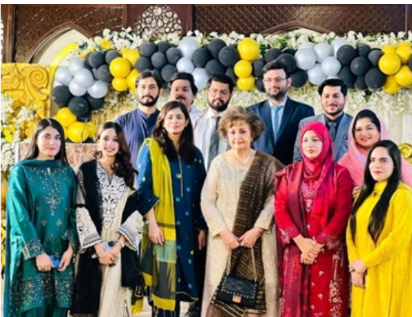
Farewell party of Batch-2018