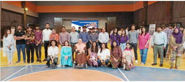
Internship fair by PSRD at Beaconhouse School System to create awareness and highlight Rehabilitative Services for Differently Abled