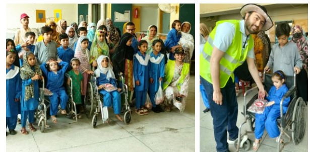
SabSaath Qurbani Meat Distribution on Eid-ul-Azha to High School Children