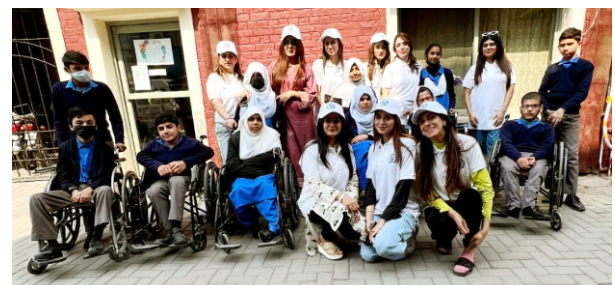
Team of Digital Influencers visited PSRD praising and highlighting services of PSRD throughout on Digital platforms