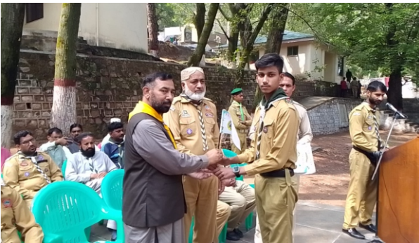
Boy Scouts received Flag of Honour during Summer Training Camp Ghora Gali Murree