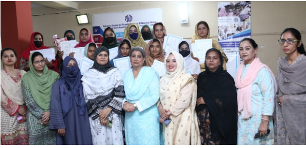
Certificate Giving Ceremony for students of Sharaqpur village, Old Bheni