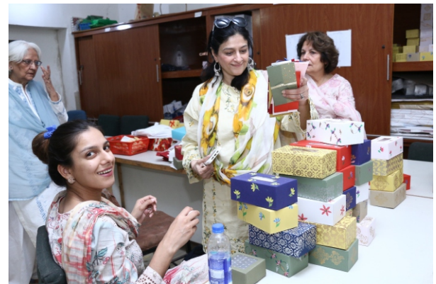
Skill Development Centre

Ms. Nadia Jamil's exclusive visit to PSRD as a goodwill ambassador was a special occasion. Her presence brought attention to the initiatives and efforts of PSRD in promoting social responsibility and development. Ms. Nadia Jamil can significantly boost morale, raise awareness, and potentially attract more support and resources to initiatives aimed at social responsibility. Her visit ended with a shopping spree at the Skill Development Centre at PSRD, where Differently abled persons are trained and empowered with skills to make saleable crafts like tissue boxes, money envelopes and gift bags.