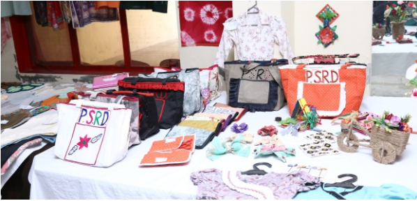
Handmade articles displayed by students at Certificate Giving Ceremony