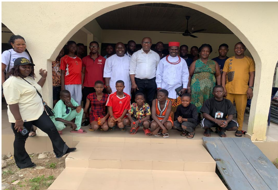
Picture 2: ENVIRUMEDIC Team/Community Group Picture at the ICT Centre.