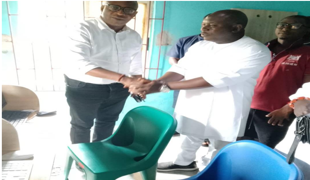
Picture 3: Presentation of the ICT Centre to the Emonu-Orogun President General.