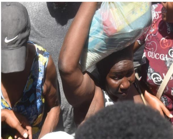
Responsible mother receiving her food kit