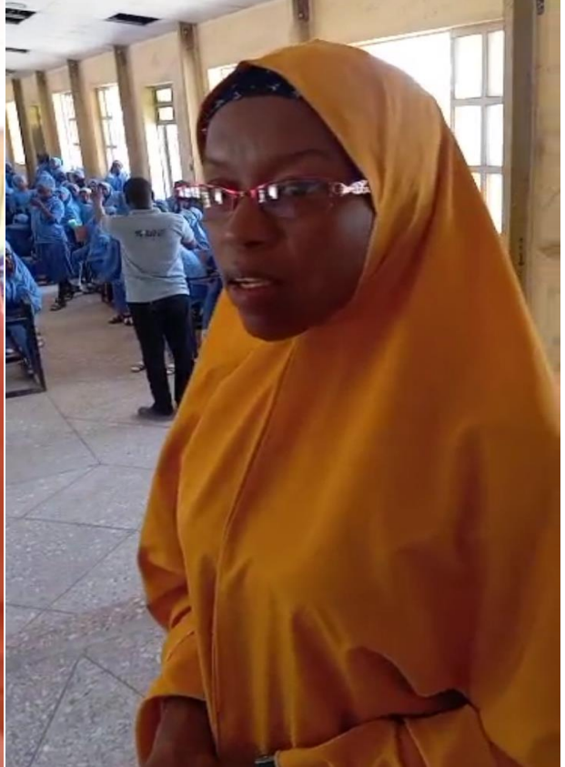
TESTIMONIES FROM GGSS STAFF AND HEAD GIRLS GGSS BAUCHI