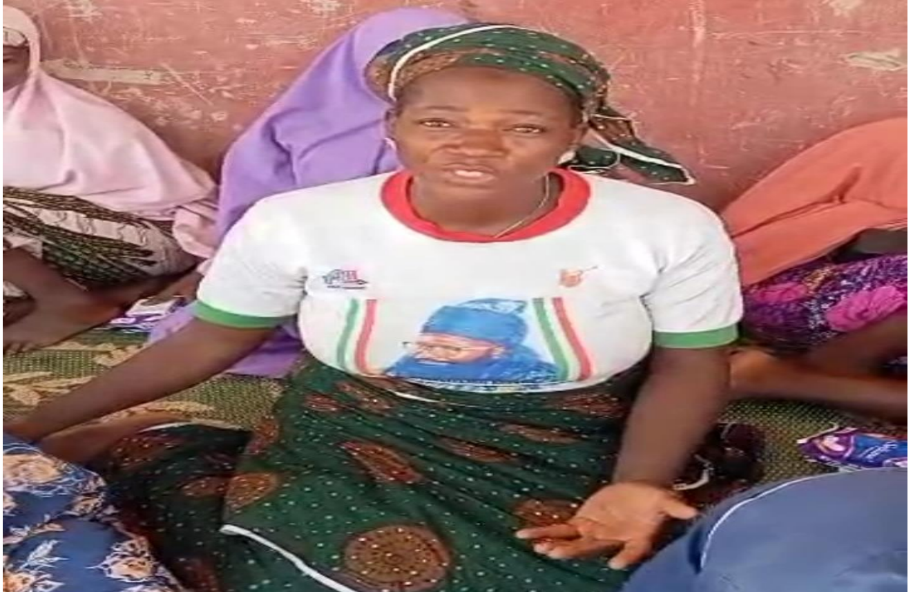
TESTIMONIES FROM SARKIN KANGERE AND SOME COMMUNITY MEMBERS