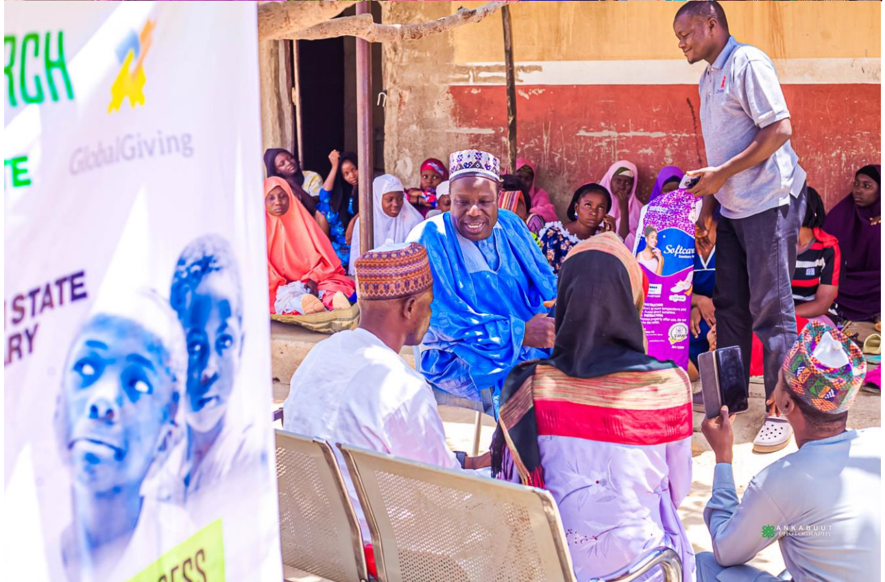
DURING DISTRIBUTION OF SANITARY PRODUCTS, DETERGENT AND DEWORMING TABLETS TO WOMEN AND CHILDREN AT KANGERE COMMUNITY, BAUCHI