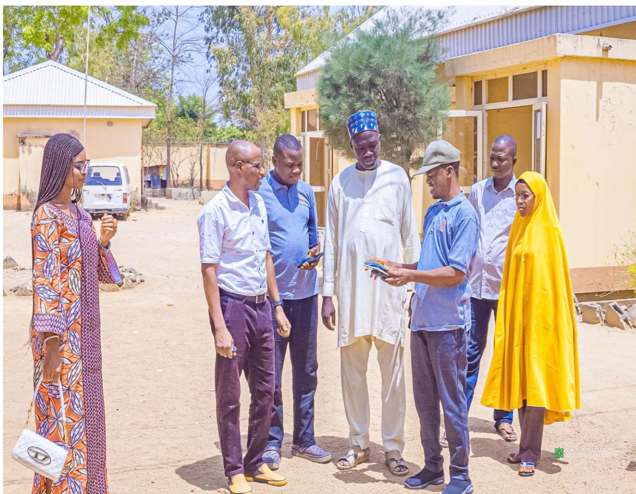
CHISTRE-GGP Team with Vice Principal GGSS Bauchi