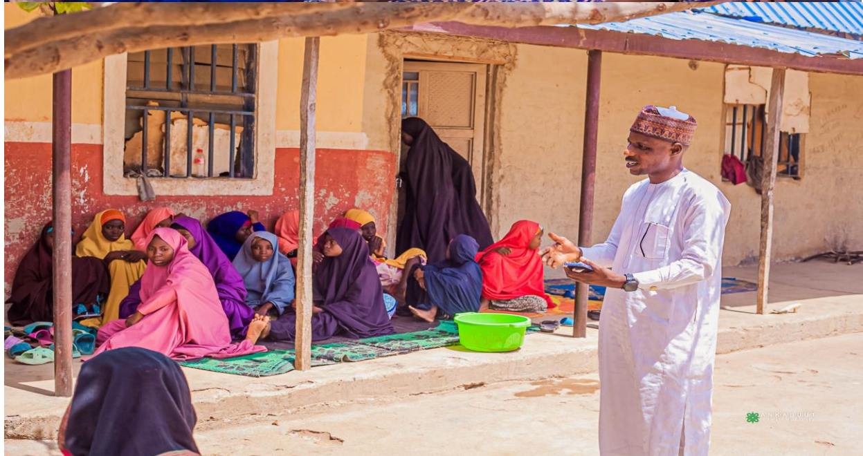
DURING COMMUNITY MOBILIZATION WITH CHISTRE-GGP TEAM & SOME COMMUNITY MEMBERS IN KANGERE, BAUCHI