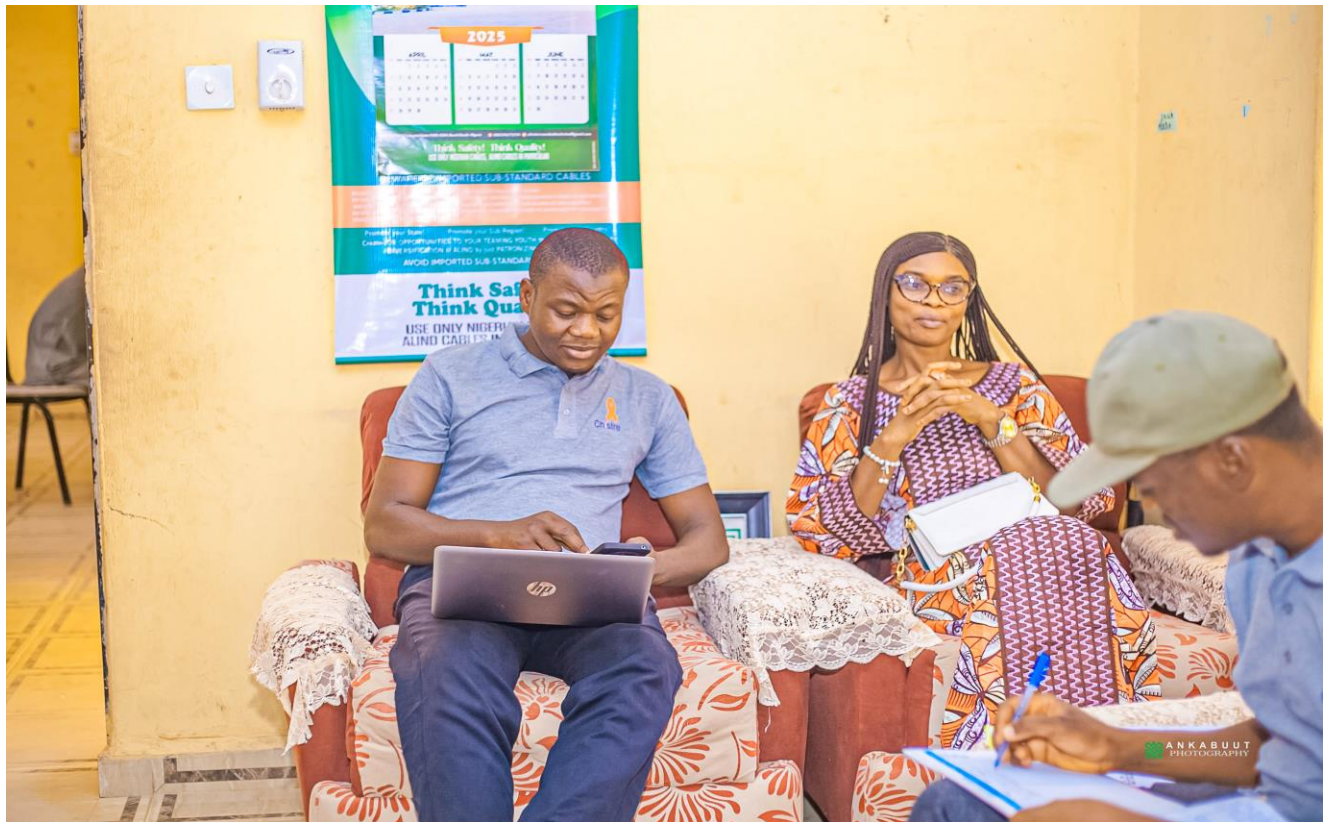
CHISTRE-GGP PERSONNEL DURING IMPLEMENTATION MEETING