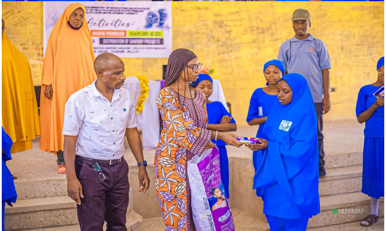
DURING DISTRIBUTION OF SANITARY PRODUCTS AND DETERGENT TO GGSS STUDENTS