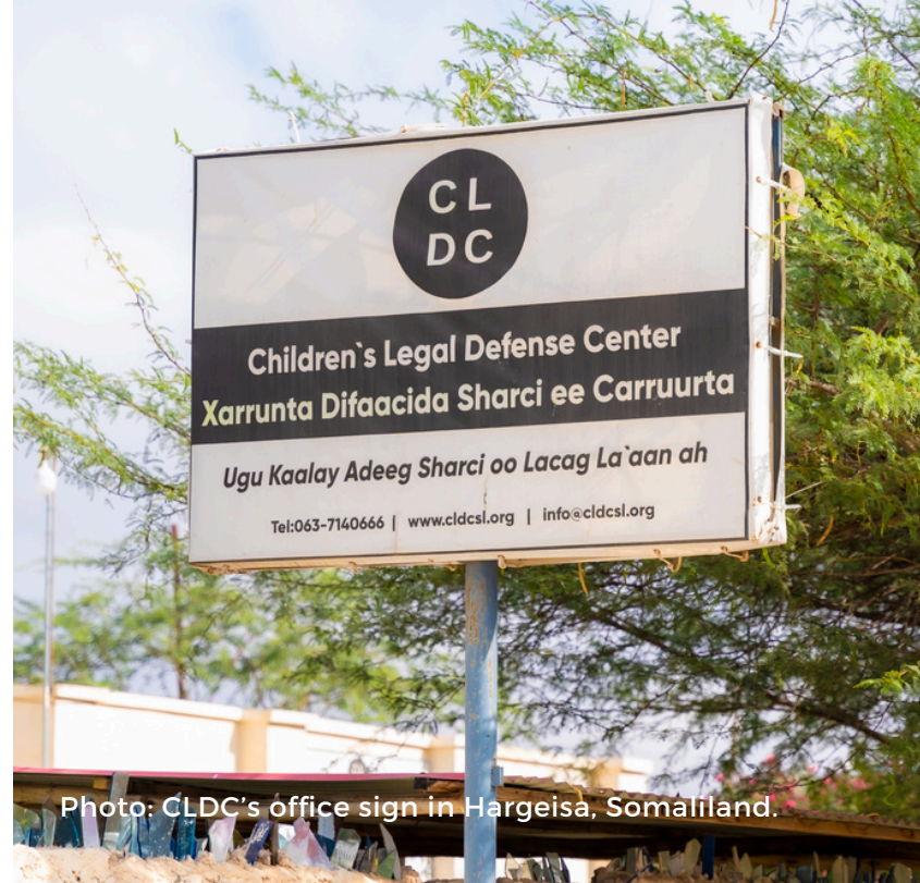
Photo: CLDC's office sign in Hargeisa, Somaliland.

Your donations helped secure the release of 353 children from detention in 2025 and reduce sentences for another 129. These outcomes reflect what your support makes possible: children leaving custody, returning to their families, and moving forward with a second chance.