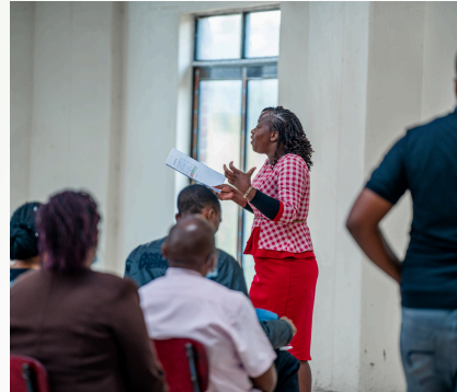
E.G. CHIEF EDUCATION OFFICER (CEO) LAUNCHPAD

Our Educator Venture Development Training Program is focused on supporting African Secondary School principals (headteachers) and senior teachers to imbue a 21st-century education mindset and culture across their institutions that can identify and nurture globally competitive African talent to build business ventures.