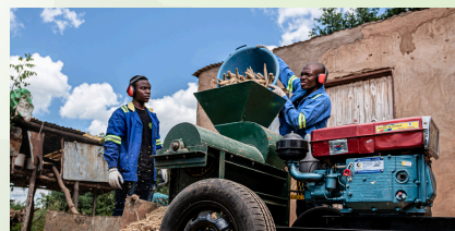
E.G. VIRTUAL INNOVATION ACCELERATOR (VIA)

Our Global Venture Accelerator identify and nurture in school and out of school learners with demand driven professional skills, toolkits, etiquette and networks to be globally competitive and bring their products to market.