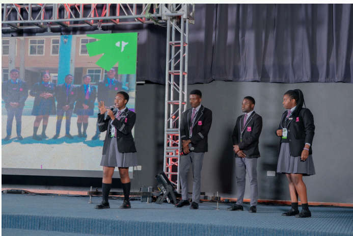
E.G. NATIONAL BUSINESS CASE COMPETITION (NBCC)