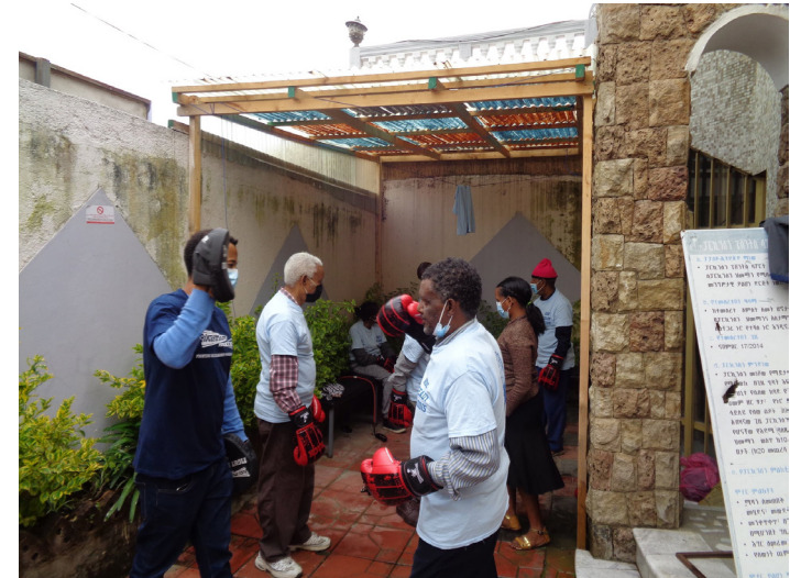
Physiotherapy for the patients