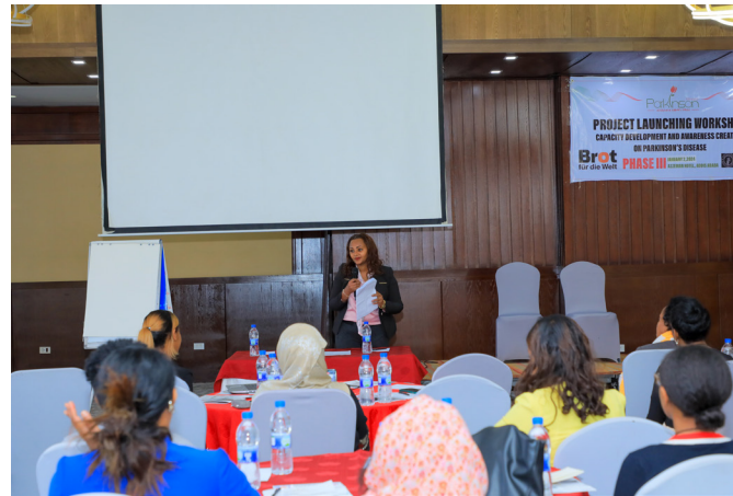
Project launching workshop