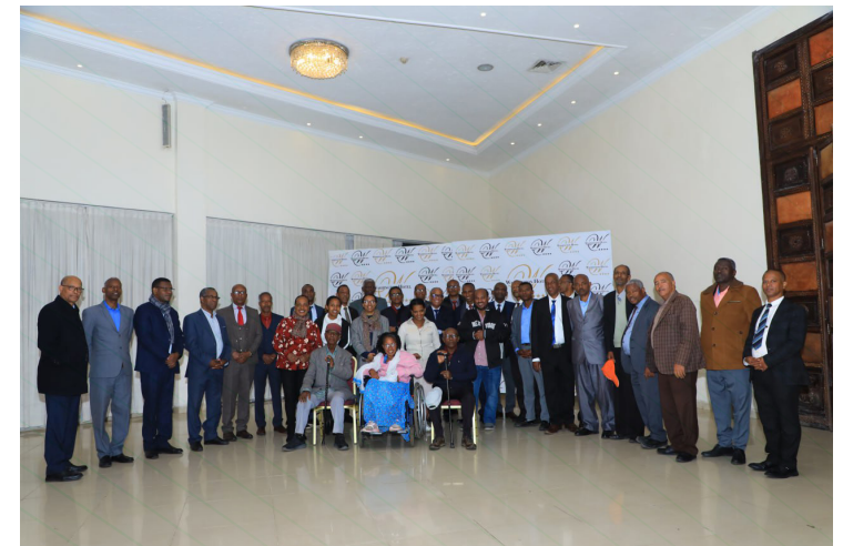
Religious leaders' training