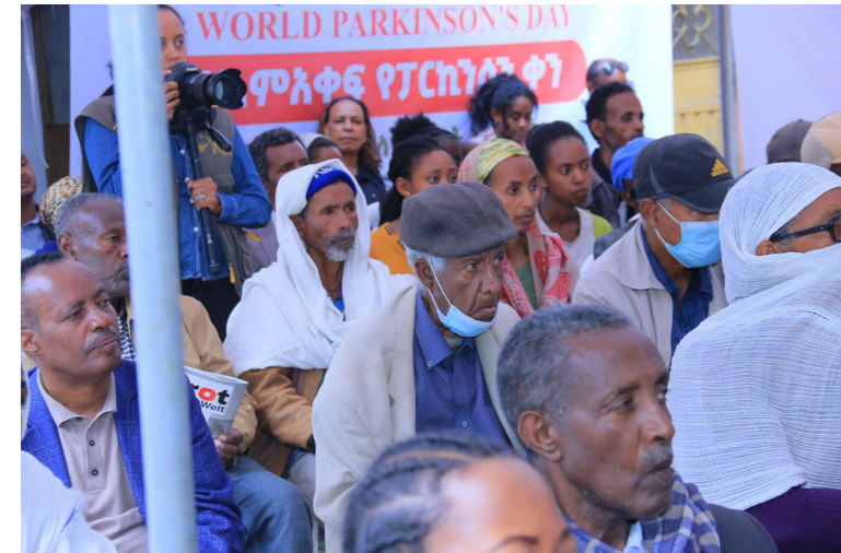
World Parkinson Day