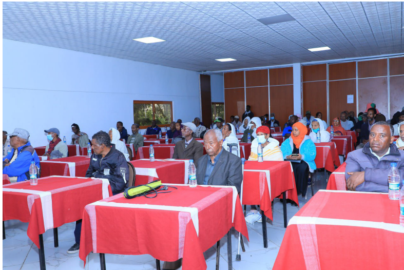
Disease Management Training

Media Engagement: Training journalists to boost public awareness and understanding of Parkinson's disease.