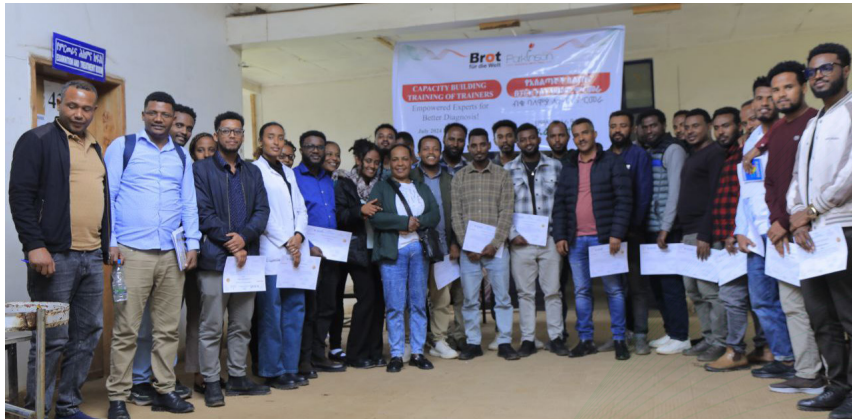
Dr's Training in Durame town