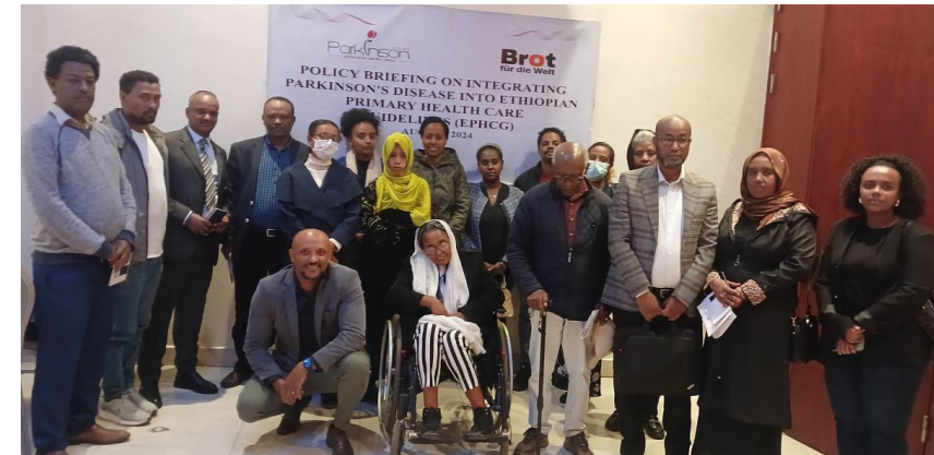
Policy briefing workshop