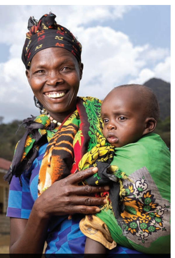
KENYA | West Pokot County | May, 2022

WHILE WE KNOW LIFE-SAVING TREATMENTS ARE EFFECTIVE, THEY ARE ONLY ACCESSIBLE TO A QUARTER OF CHILDREN WHO NEED THEM.