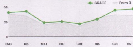
Subject Performance - Student vs Class