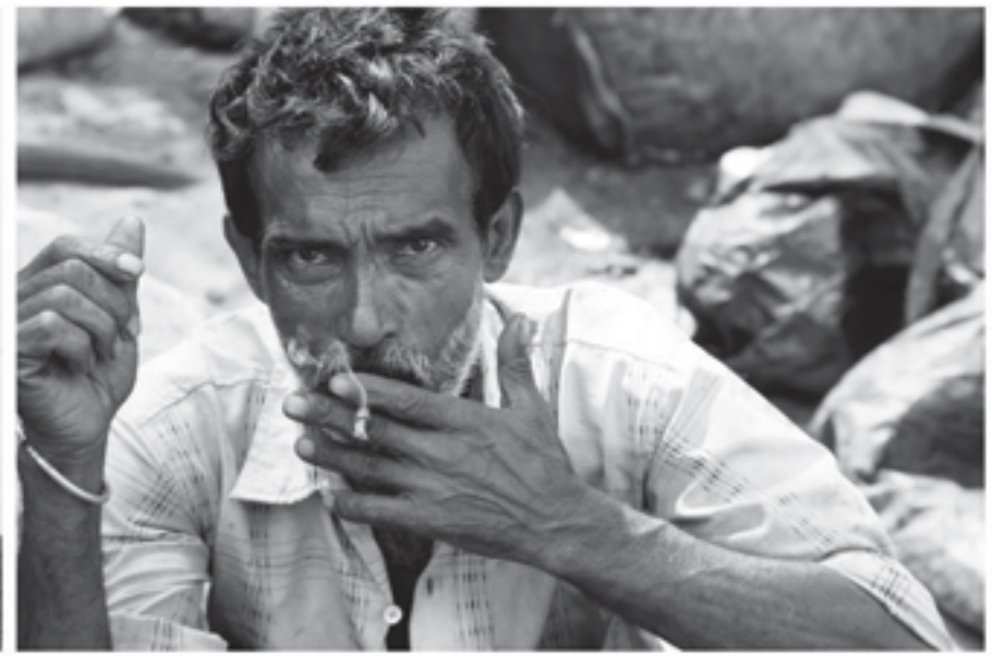
TB patients in their homes and neighborhoods during visits by Operation ASHA's counselors.