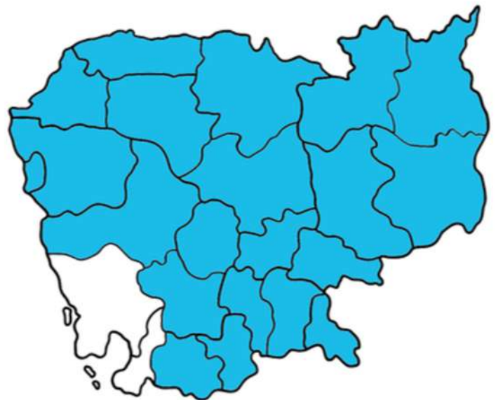
Areas where our students in PNC come from