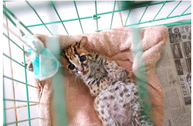
Leopard cat in care (camp of Pararawen, Borneo)