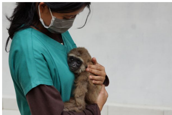
Veterinary with young gibbon in care