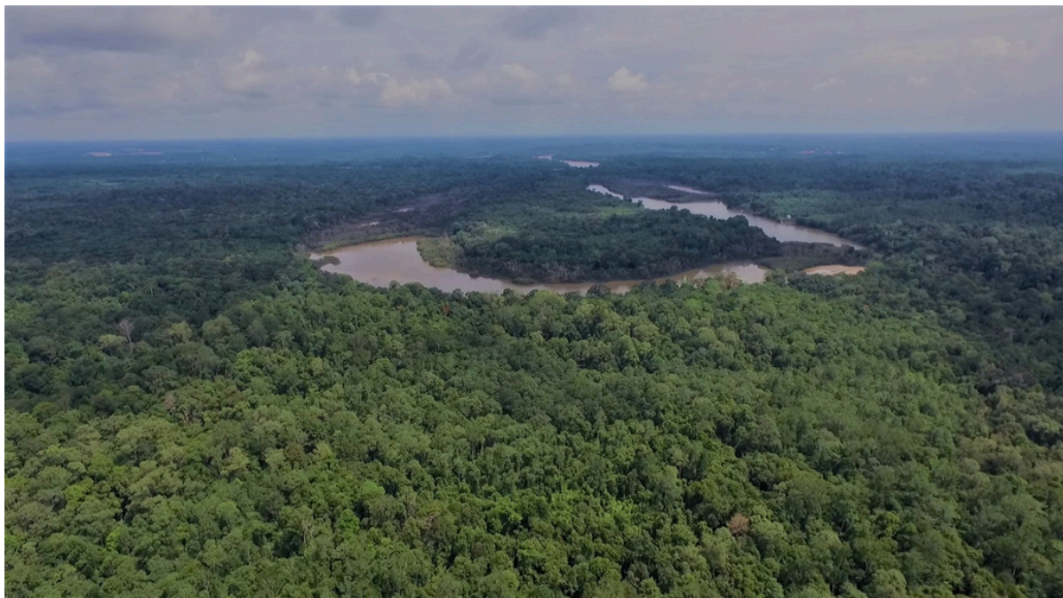
The Dulan Reserve and its Lake (Borneo)

statutes and bank accounts. Their role is to promote Kalaweit's field actions to raise funds to finance actions in Indonesia.