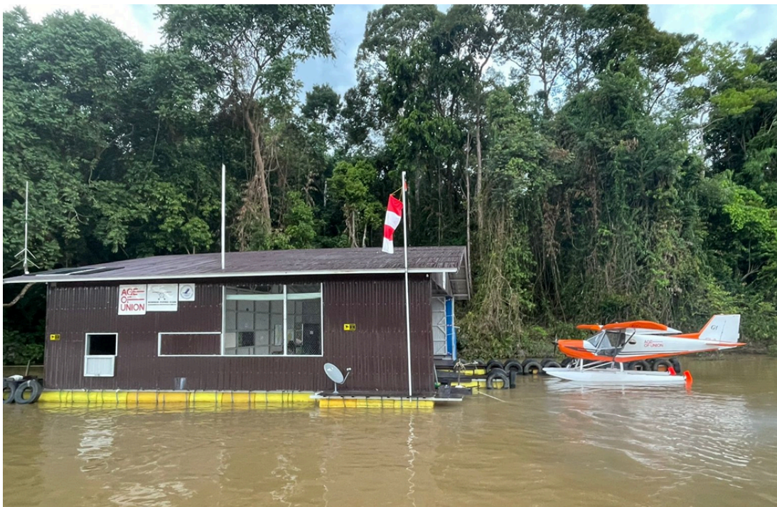
Hydravion in front of the hangar situated outside the camp of Pararawen on the river Barito (Borneo)

An instructor pilot and a mechanic arrived at the Pararawen camp in Borneo to strengthen the Chanee seaplane pilot training and the maintenance and repairs to be performed on the aircraft between each revision.