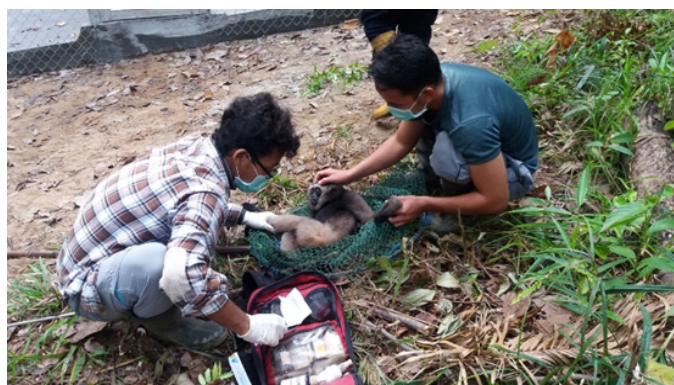
Veterinary check during a change of aviary

Types of pathologies encountered: generalized infection, pericarditis, tetanus, cancer tumor, respiratory distress, pneumonia, gastroenteritis, nephritis, internal bleeding, stress.