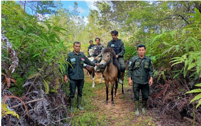
Equestrian Patrol Supayang Reserve (Sumatra)