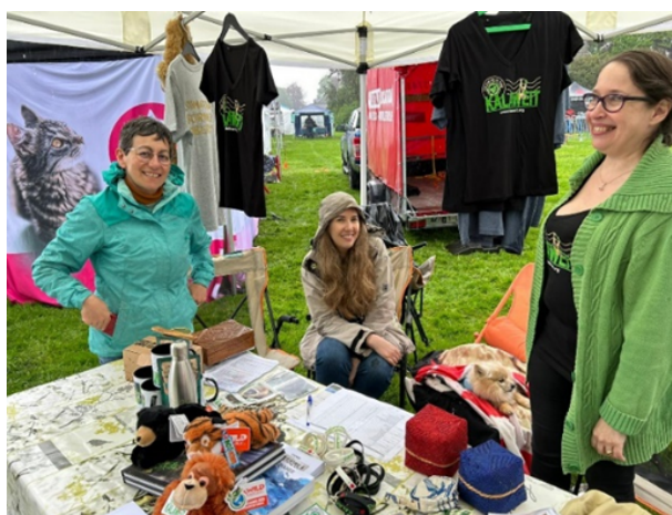
Stand team Kalaweit Belgium

Several booths were held by our volunteers in Vienne (38), Valenciennes (59), Fayence, Paris (75) or La Barben (13), which helps to make the association known to the public and to raise funds by selling products or obtaining donations. The products are also available for sale in our online store.