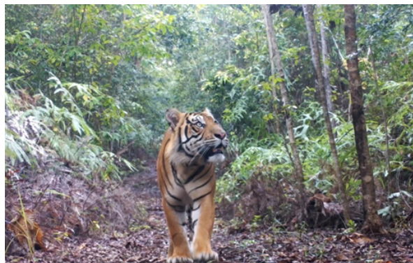
Tiger in our Supayang (Sumatra) reserve

No illegal acts (logging, hunting) have been recorded in our reserves. Our equestrian and air patrols in paramotor and hydraction are extremely deterrent.