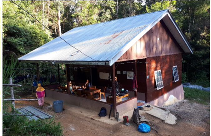
General Building, Supayang Camp (Sumatra)