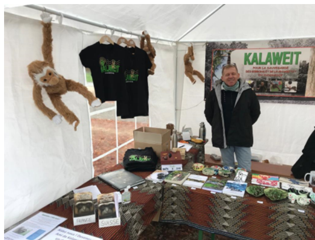
Stand team of Kalaweit Switzerland