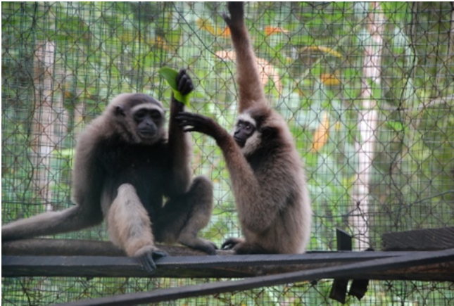
Couple of gibbons (camp of Pararawen, Borneo)