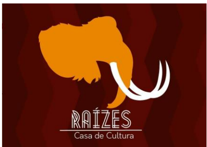
Casa de Cultura Raízes