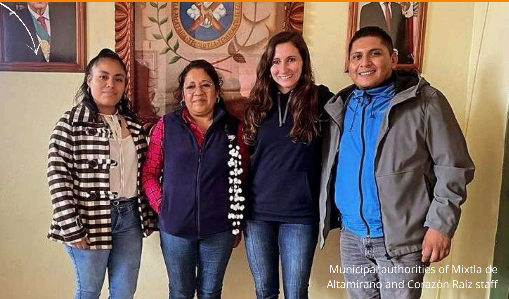
Municipal authorities of Mixtla de Altamirano and Corazón Raíz staff

With this comprehensive approach, we aim to serve three communities each year, maximizing our impact.