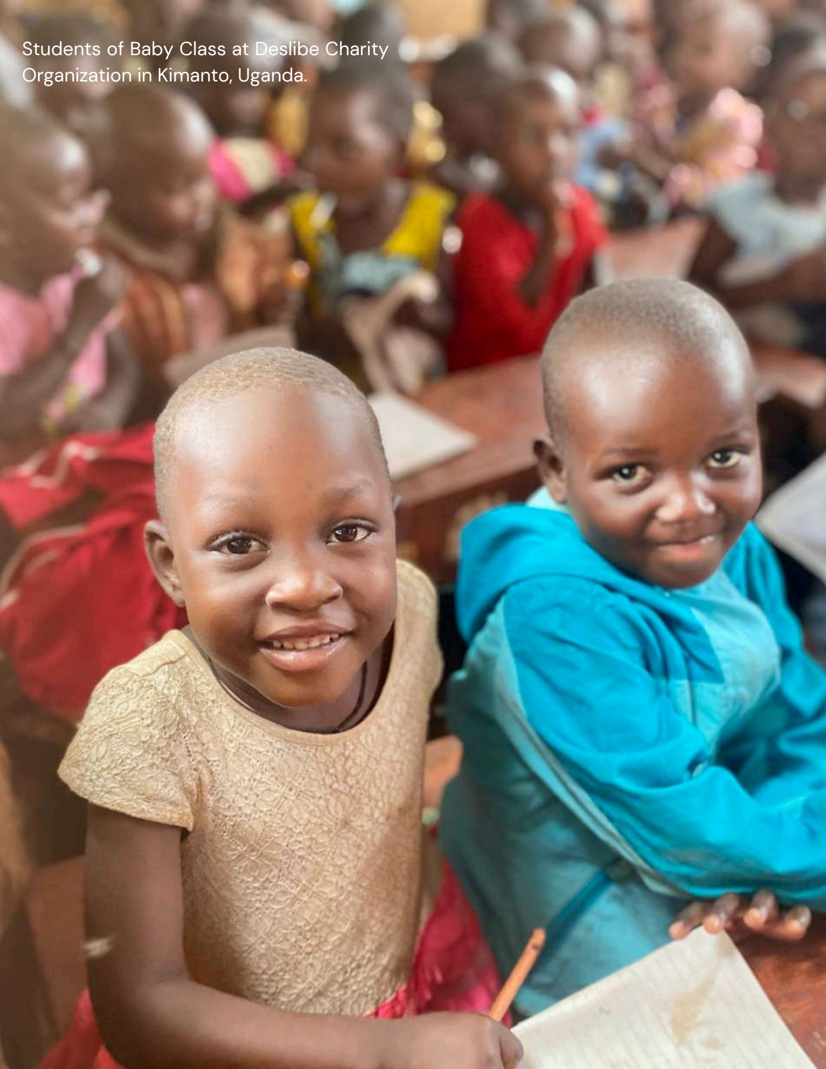
Students of Baby Class at Deslibe Charity Organization in Kimanto, Uganda.