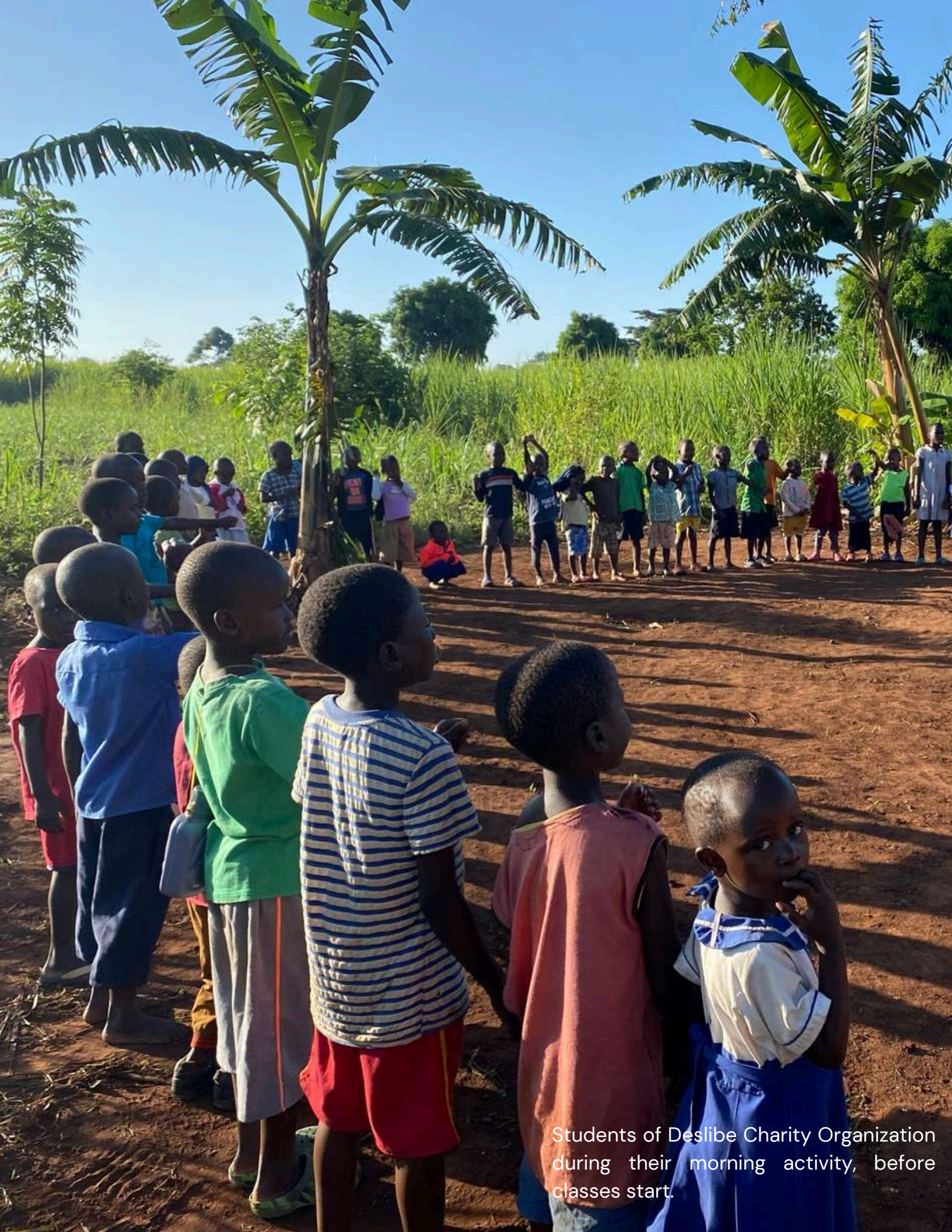
Students of Deslibe Charity Organization during their morning activity, before classes start.