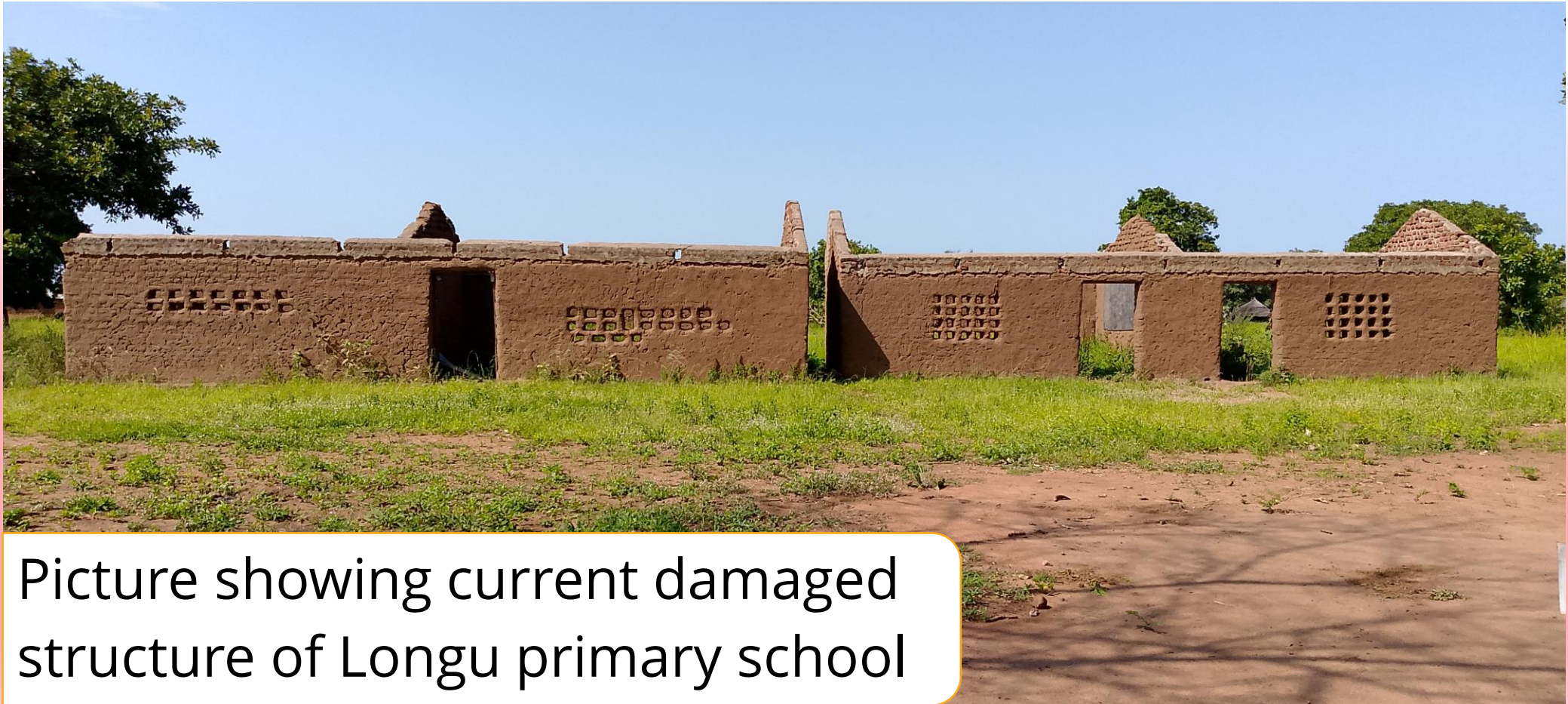
Picture showing current damaged structure of Longu primary school