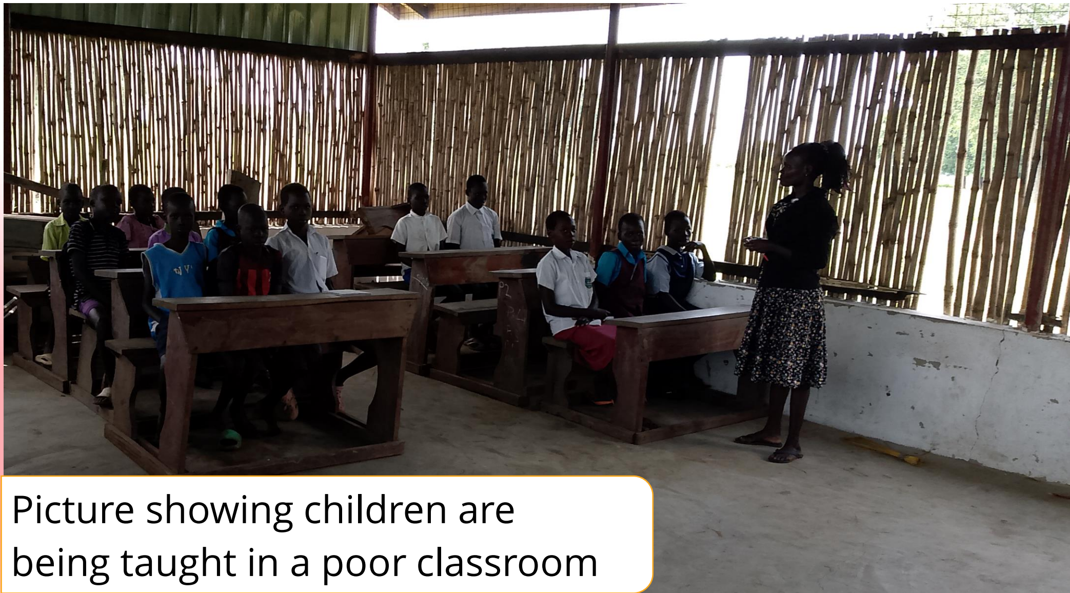
Picture showing children are being taught in a poor classroom