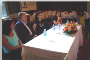
Representatives from L'Oréal, Senac and Renascer at the graduation.