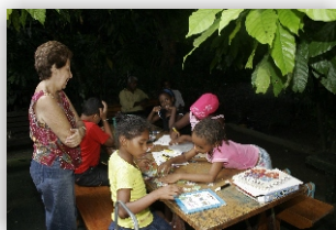
Recreation for children while mothers are in course or being attended.

the beauty salon, which went through infiltration problems resulting in some damages and needs repair and painting.