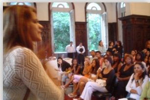
Graduation of 60 students from the Beauty Parlor - Jun 10th 05

Currently this project is sponsored by the Kinder Institute (who invest financial resources in the training courses, pay the instructors and the structure) and receives the support of L'Oreal (build the beauty salon/school, provides products at cost price and offers professional training), SENAC (offered 'know how' and consulting for the beauty training) and Global Giving (provided a donation). The donation