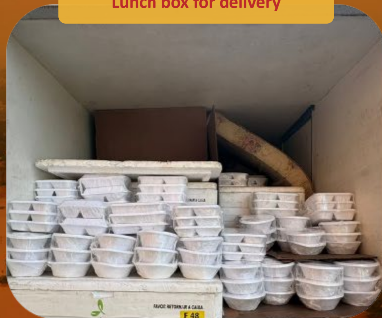
Lunch box for delivery