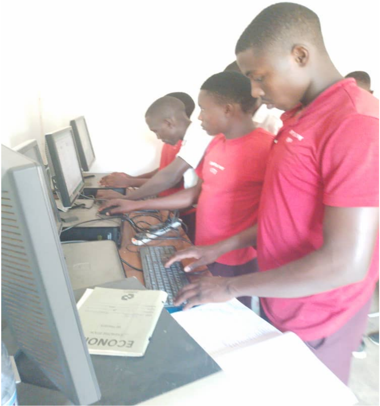
Students of Pearl High School Learning how to use a computer