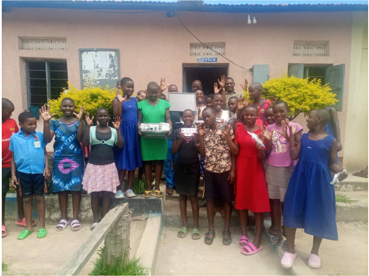
Pupils of Sya Bright Future Primary School receiving computer