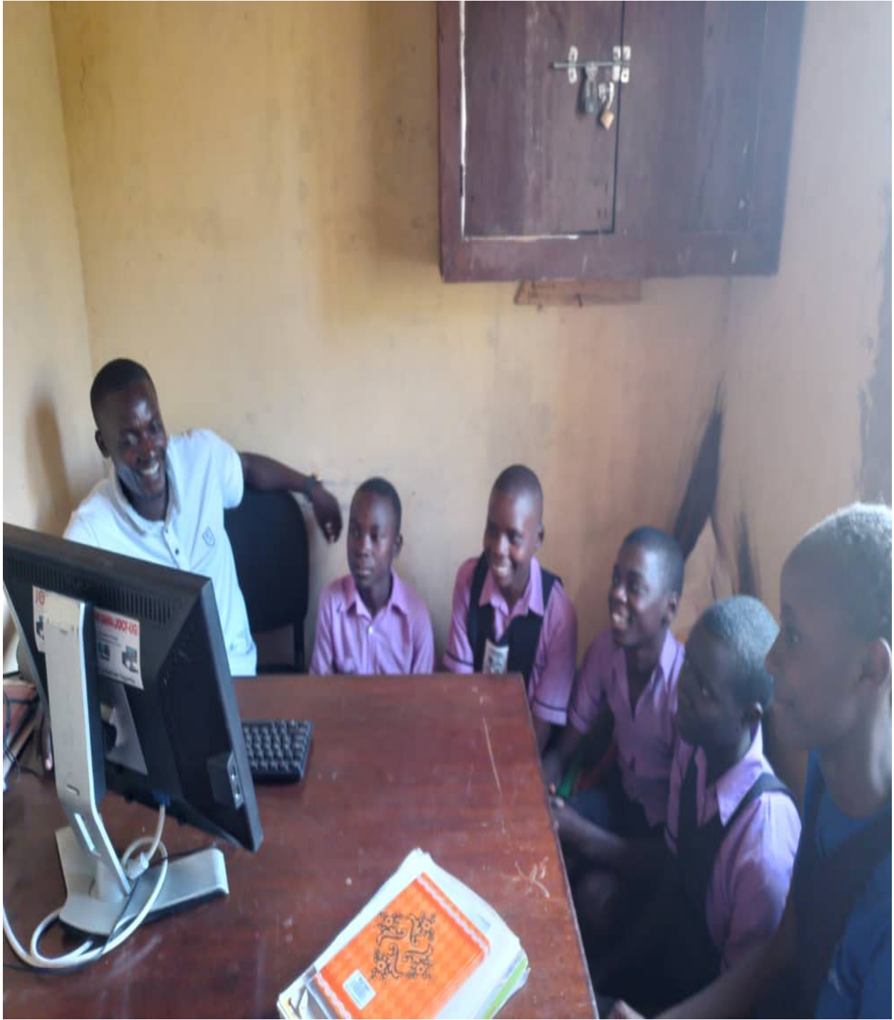
Pupils of Solomon Memorial primary school being shown how to use a computer