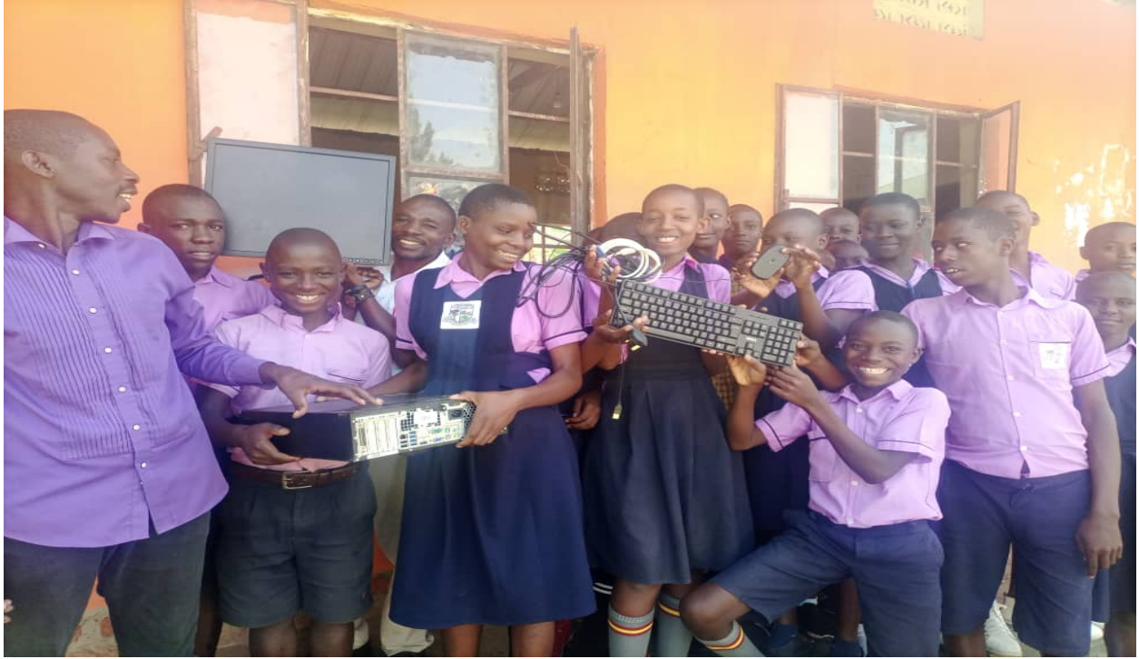
Pupils of Solomon Memorial primary school receiving the computers