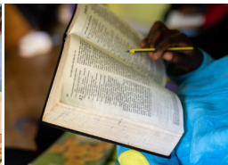
Bible reading during morning worship