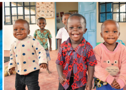
Neema children at the new campus's children's building