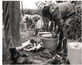
Neema students washing their clothes

Neema Program: $439,664 Capital Campaign: $232,058