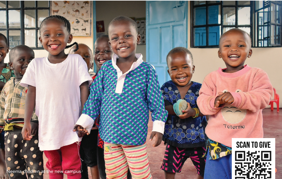
Neema children at the new campus

Give today to provide for twice as many young women and children in need in rural Kenya. Their future is in your hands.