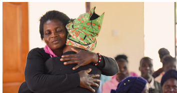
Forgiveness at a seminar for incoming students and guardians

CHVRCH Newtown Square Goshen Baptist Church Meadowcroft Presbyterian Church Providence Church