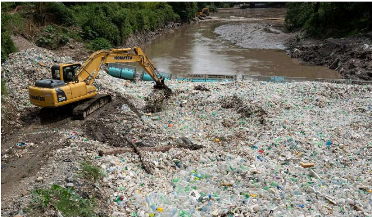
Motagua River Bio Fences by Ocean CleanUp 2023.