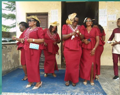
Left-right: Our Co-founders handing Silverman Excellence Award Prize, and certificates of graduation respectively, graduating students pose for a picture, GBPPS Director and staff dancing to open the ceremony.