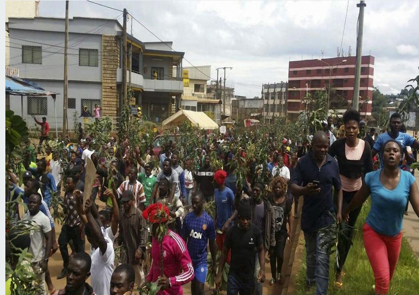
Cameroonians holding peace plants and advocating for peace in our country

Since the onset of Cameroon's Anglophone crisis in 2016, over 855,000 children have been forced out of school, according to UNICEF, with a significant number being internally displaced persons (IDPs), especially girls. These vulnerable girls face alarming risks of exploitation, prostitution, and human trafficking, with many resorting to negative coping mechanisms due to limited opportunities for a better future. Traditional assistance methods have proven unsustainable, failing to equip these girls with the skills necessary to enter the job market and build a stable life. In response, Hope for Cameroon launched a project aimed at training 100 vulnerable internally displaced girls and those from low income backgrounds each year and empowering them with essential ICT skills to reclaim their futures.