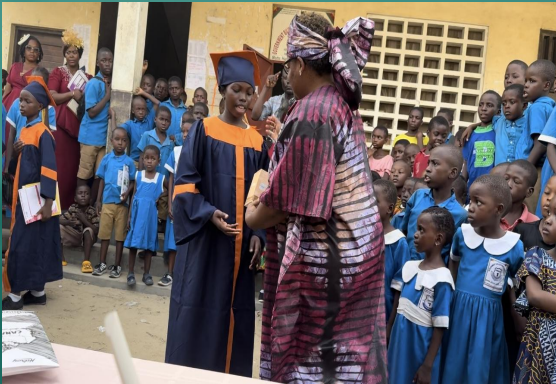
IDP Girls receive sanitary pads from Hope for Cameroon