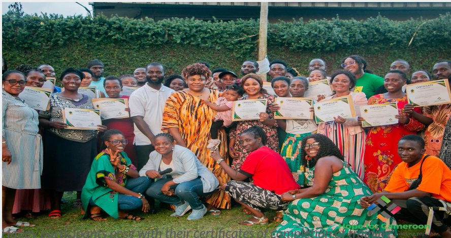
Participants posing with their certificates