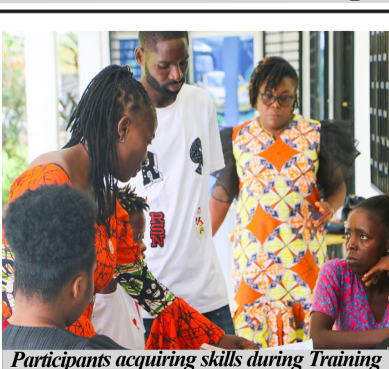
Participants acquiring skills during Training

NW,SW Crisis: HfC NGO Empowers IDPs On Financial Independence, Entrepreneurship Page 2