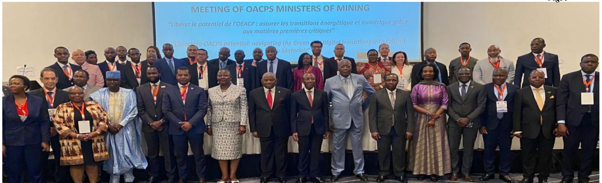
OACPS Mines Ministers pose for family photo

NW,SW Crisis: HfC NGO Empowers IDPs On Financial Independence, Entrepreneurship Page 2