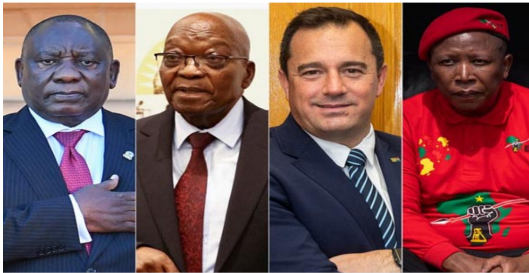
A combination image showing Cyril Ramaphosa, Jacob Zuma, John Steenhuisen, and Julius Malema

port from Black voters: it opposes policies such as workplace race quotas introduced by Ramaphosa's government last year to close economic gaps that have seen Black people perpetually disadvantaged. This is why some criticise Steenhuisen and the DA caucus for being unaware of the conditions of the majority of South Africans. Steenhuisen himself has deflected accusations of representing an advantaged minority by saying South Africans are looking for competence.