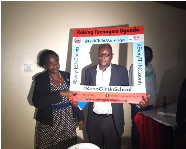
PLANE Officials after sensitizing the girl child on the value of education and avoiding teenage marriages

Two groups of the Young Mothers were formed, registered with the sub county to benefit from the government Youth Livelihood Program (YLP). The sub county Community Development Officer (CDO) has already submitted their files with photos attached to the District Community Development Officer (DCDO) for screening before they are sent to the ministry.