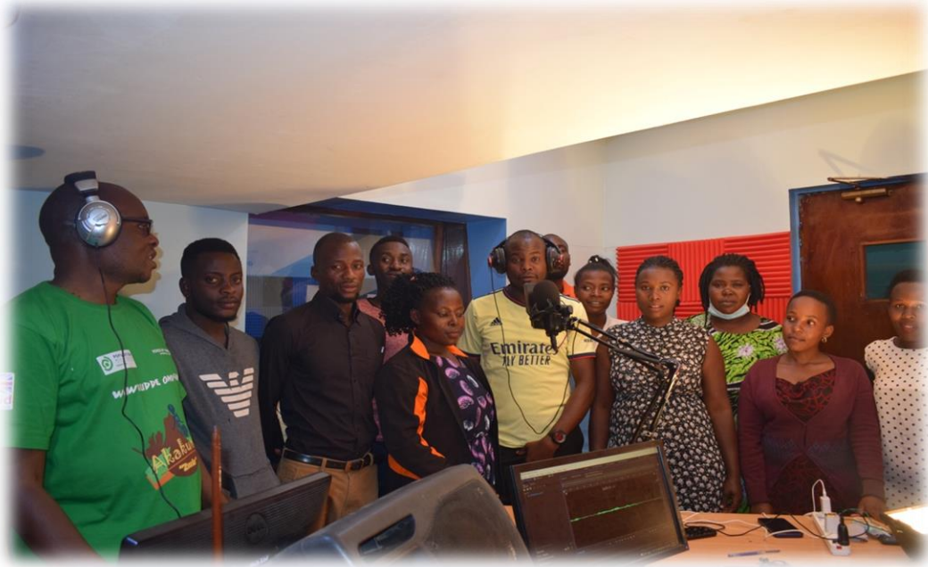
Our Bahemuka team pose for a photo in VOT production studio before kicking off with auditions on one of the Saturdays