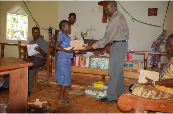
PLANE Officials distributing scholastic materials to orphans