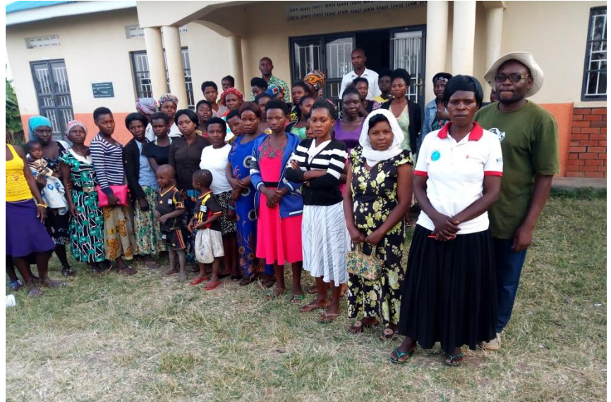
PLANE officials & teen mothers pose for a photo after training in reproductive health issues and nutrition of their children