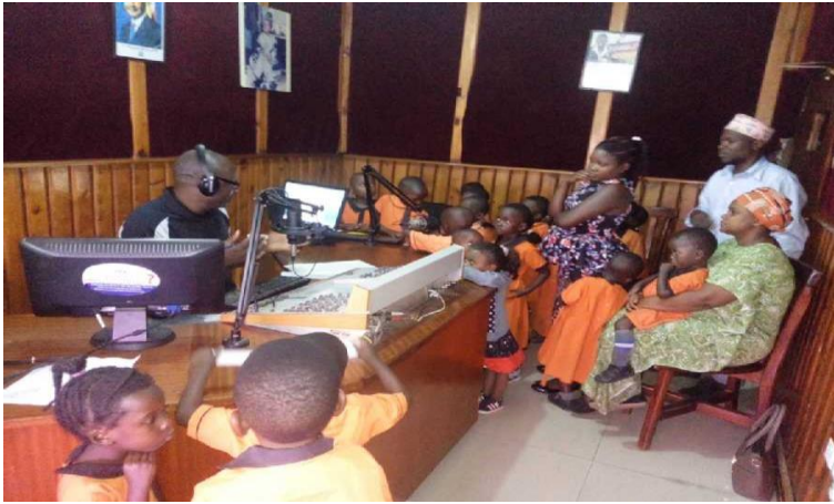
Child Rights Advocacy program. A Voice for the voiceless