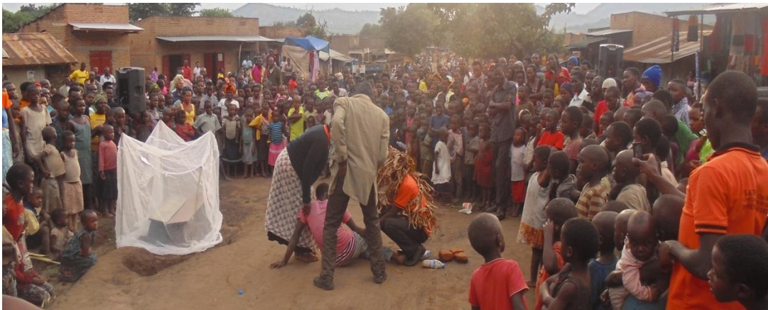
Drama performance on Malaria prevention. Play depicting malaria mistaken for witches in Kasenda rural sub county Kabarole

The campaign dubbed: “ Community Campaign for Social Mobilization (CCSM) ” follows a survey indicating high cases of malaria as a result of poor utilization of the distributed mosquito nets in the rural areas of Kabarole and Bunyangabu districts. PACE contracted our drama to conduct outreach in communities and primary schools in these districts. It was aimed at creating awareness within the communities on malaria prevention and control. 52 schools and 61 communities were reached and sensitized on malaria prevention and control.