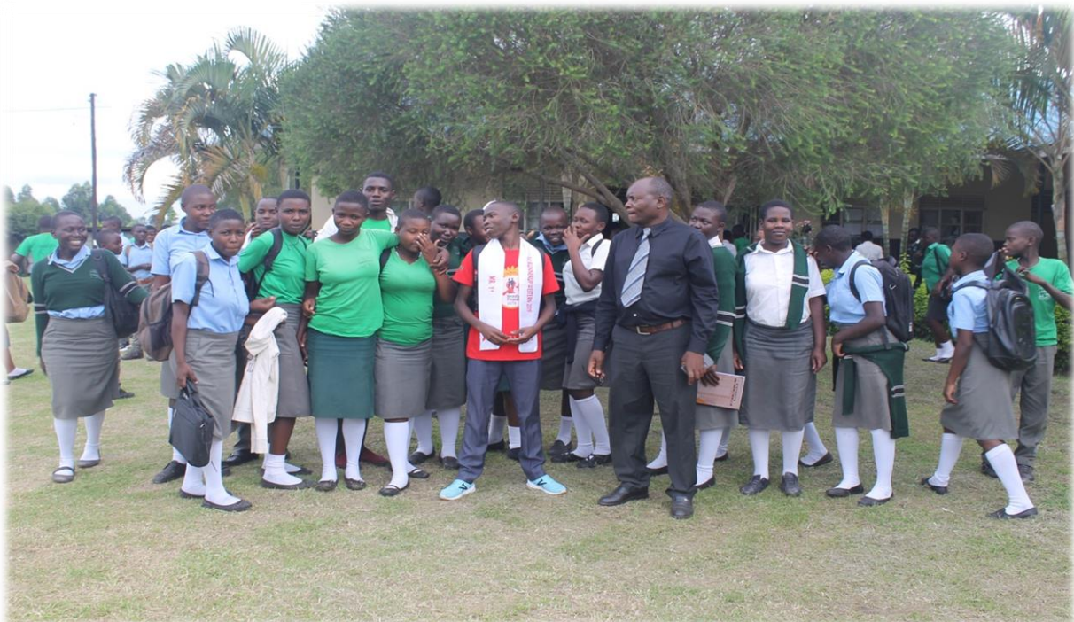
President Y+, PLANE Director & Kagote Sec Students-SRHR Guidance