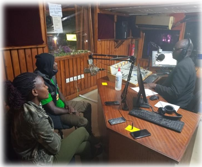
Youth hosted to discuss on Youth Unemployment and participation in gov't programs can reduce the problem.