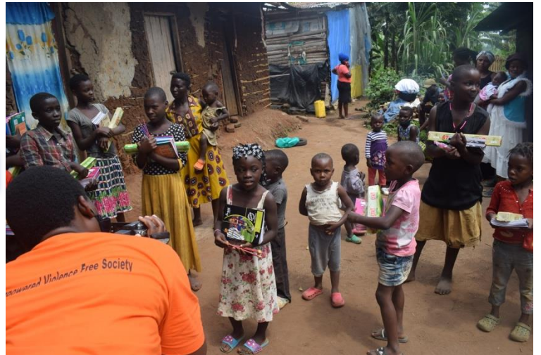
Children receive scholastic materials in Futi Butangwa, Fort Portal.