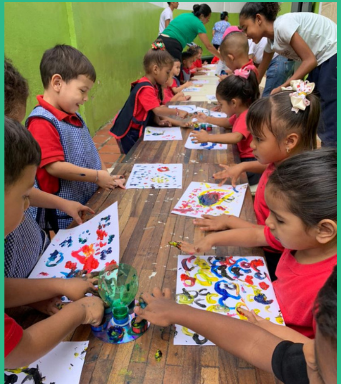
THE "I AM THE PAINTER" ACTIVITY WITH 300 STUDENTS AT FEDERICO QUIROZ SCHOOL