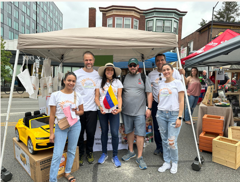
RAISING FUNDS IN 2023, PENNSYLVANIA