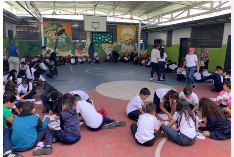
FUELING CREATIVITY AND LEARNING FOR 300 KIDS! WE BELIEVE IN SMALL GROUP PROJECTS TO INSPIRE YOUNG MINDS. -FEDERICO QUIROZ SCHOOL, CATIA, CARACAS.

Our mission is to help underprivileged children in Venezuela by providing access to education, athletic activities and other essential resources to guide them towards a more productive and positive life. Our vision is to ensure that every disadvantaged child has access to the tools and experiences necessary to succeed in their youth. Our nonprofit focuses on mission-oriented programs that align with this vision, striving to make a lasting impact on the lives of vulnerable youth.