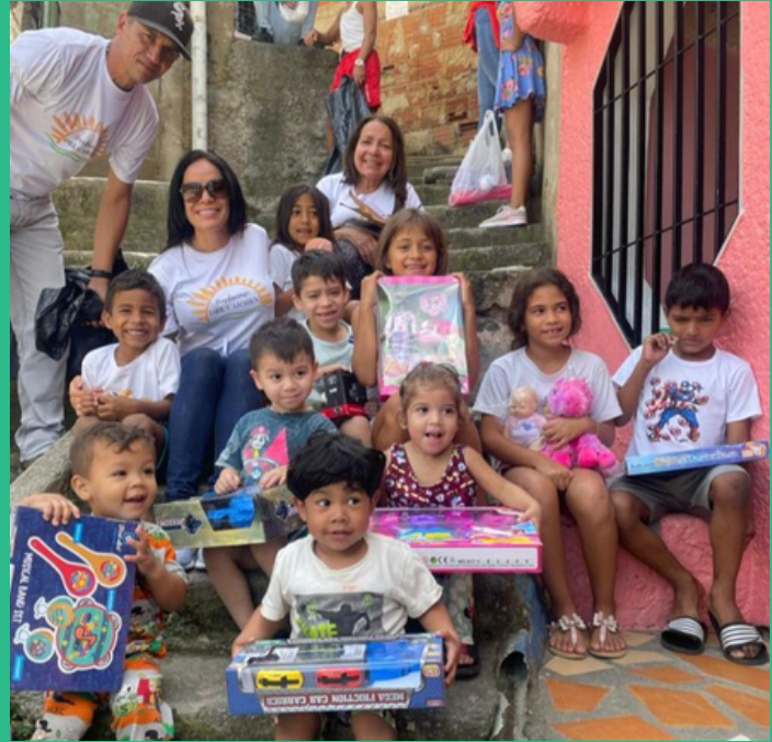
TOY DRIVE FOR CHRISTMAS, 2022 - 500 KIDS