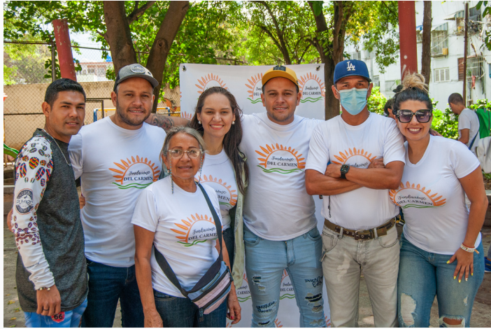
VOLUNTEERS IN OUR FIRST EVENT IN 2022, VENEZUELA

WE ARE PROUD TO HAVE A DEDICATED TEAM OF OVER 30 VOLUNTEERS SPANNING ACROSS THE UNITED STATES AND VENEZUELA, TIRELESSLY WORKING TO AMPLIFY THE POWER OF YOUR GIVING AND EXTEND AID TO THOSE IN NEED. OUR COMMUNITY LEADERS IN VENEZUELA VENTURE INTO VULNERABLE AREAS TO CONDUCT THOROUGH SOCIOECONOMIC STUDIES TO IDENTIFY AND ASSIST DISADVANTAGED YOUTH. THIS CRITICAL GROUNDWORK, WHICH SPANS OVER MONTHS, UNDERSCORES OUR UNWAVERING COMMITMENT TO SERVING THOSE MOST IN NEED. MONTHLY GATHERINGS UNITE US AS WE STRATEGIZE FOR UPCOMING DONATION DRIVES AND BRAINSTORM INNOVATIVE FUNDRAISING INITIATIVES, ENSURING THAT OUR COLLECTIVE EFFORTS MAKE A MEANINGFUL IMPACT.