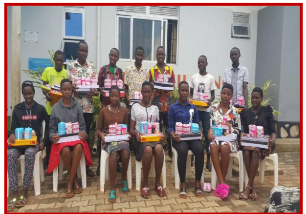
Inset: Caregivers who accompany their children to get scholastic materials in January 2022, pose for photos