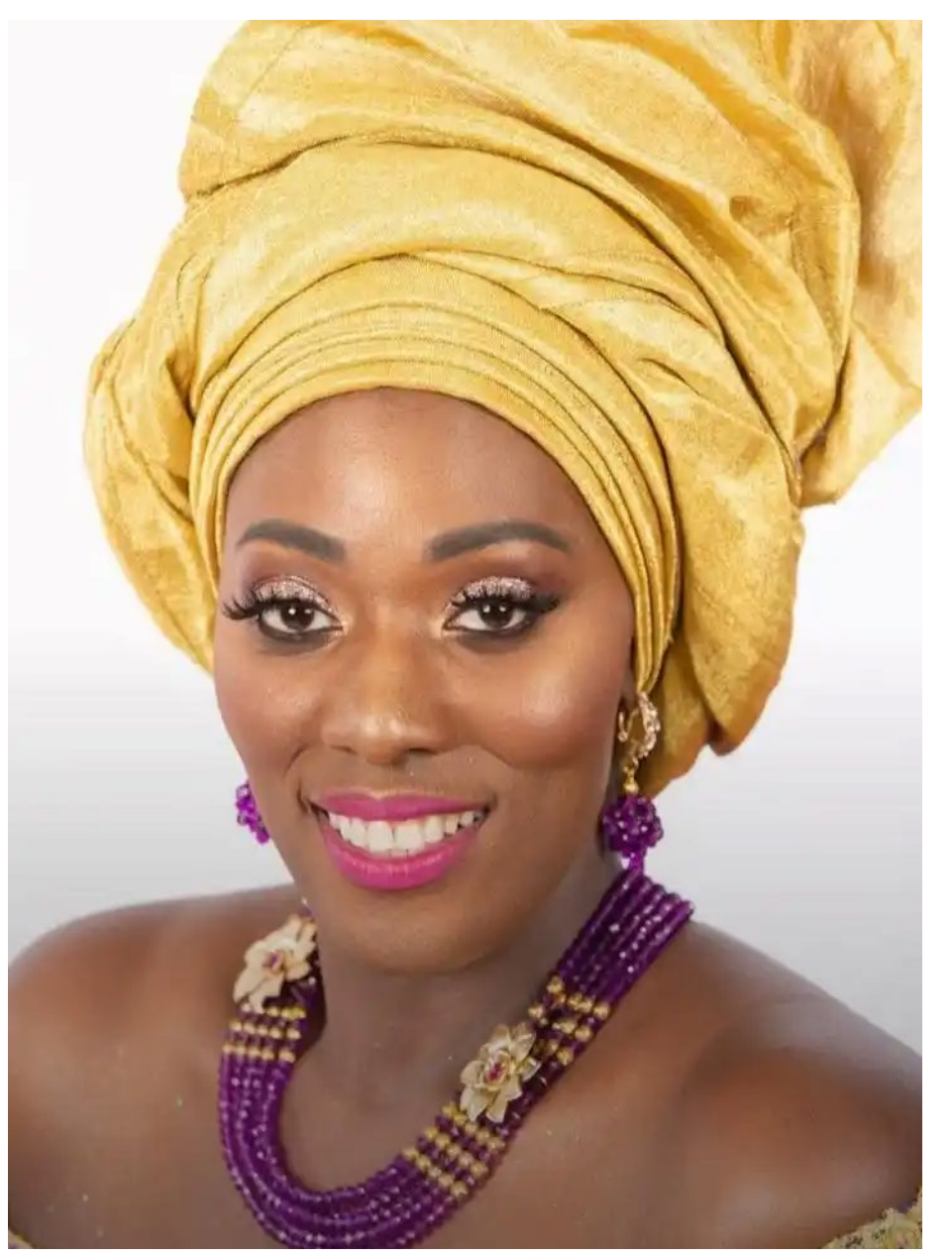
United We Stand and Together We Rise