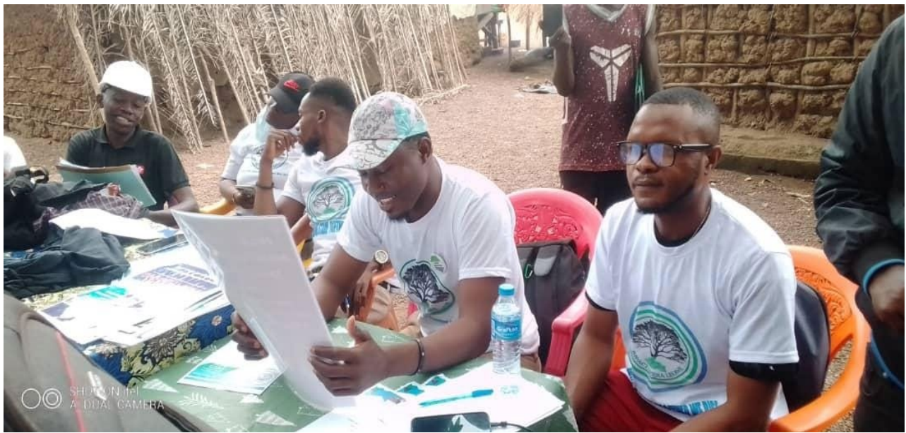
ISL volunteers and staff holding introduction meeting with the community during April 5 th Site Visit