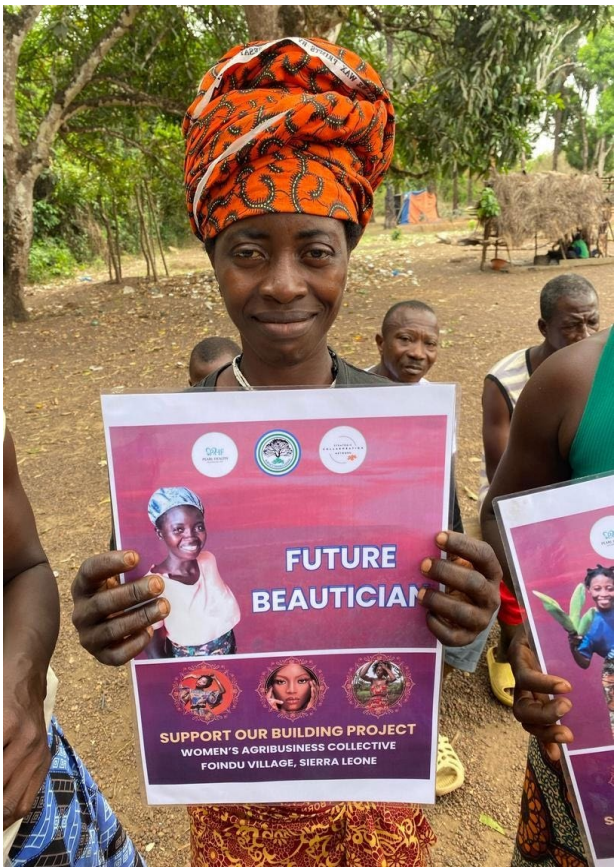
Above are members of the Women's Agribusiness Collective group holding empowerment posters during the April 5 th Site Visit. They are future business owners and want to learn how to sew beautiful dresses as well as crafts to support their families.