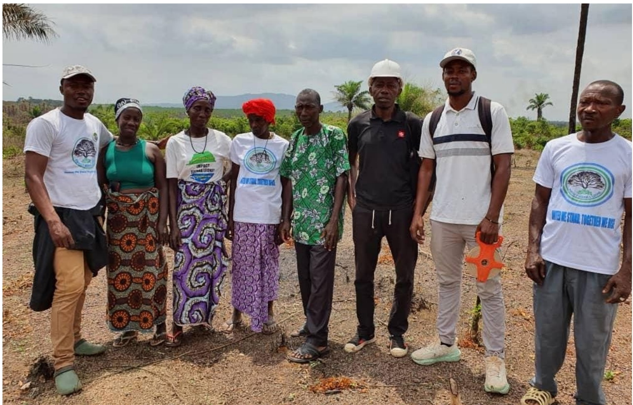
Impact Sierra Leone volunteers with community members on the future site of the Impact Vocational Training Center for women farmers – Site Visit – April 5, 2025