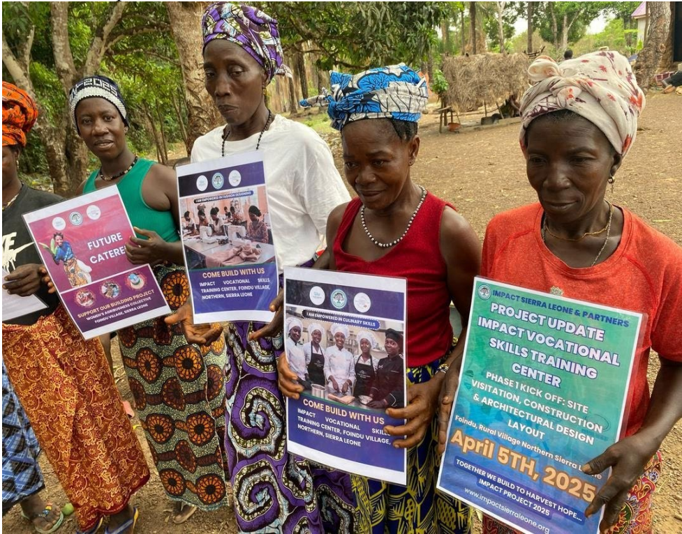
Women Farmers at Foindu Village during the Site Visit holding empowerment signs. They are going to be in the first-class participants at the Impact Vocational Training Center for women farmers

measurements for the building and soil samples for the foundation plans. Empowerment posters were designed for the women as an added feature along with a lot of cultural singing. Refreshments were provided for all attendees prepared by the women farmers. The women farmers of Foindu Village are eager and excited—ready to embrace this opportunity to transform their futures through skill and craftsmanship.