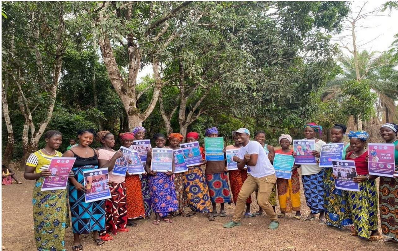
Women Farmers at Foindu Village during the Site Visit holding empowerment signs. They are going to be in the first-class participants at the Impact Vocational Training Center for women farmers.