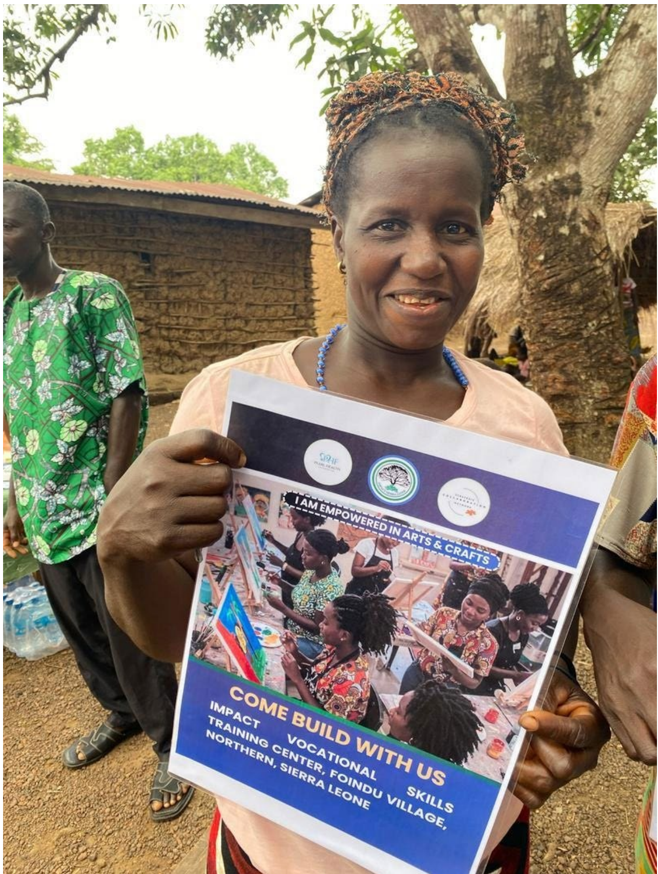
Some of the women farmers during the April 5 th Site visit who will benefit from the Impact Vocational Training Center. They are very excited at the future building that will transform their village.