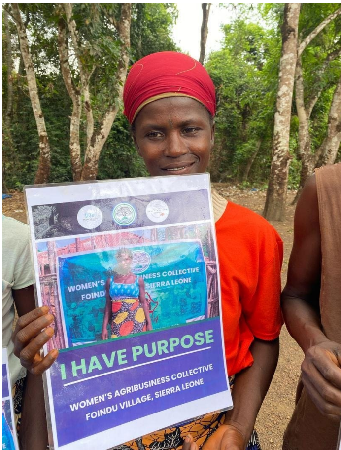
One of the women farmers holding an empowerment poster designed for the Site Visit event. She is a proud member of the Impact Women's Agribusiness Collective at Foindu Village. Below is one of our Impact volunteers addressing the community and another member of the Impact Women's Agribusiness Collective.