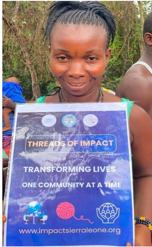
More members of the Women's Agribusiness Collective group holding empowerment posters during the April 5 th Site Visit. These women are hardworking farmers who desire to create a better future for themselves and families.