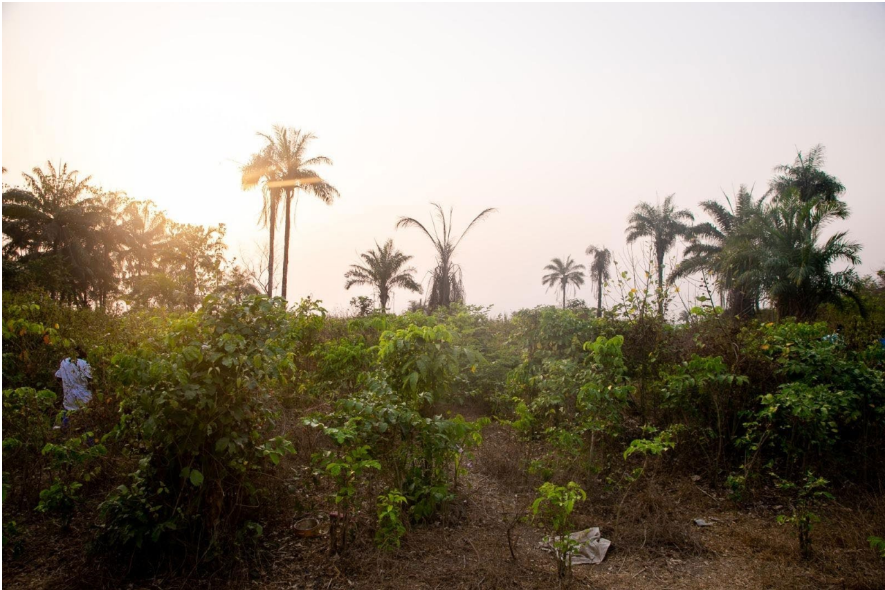
This is the Site of Future Impact Vocational Training Center for women Farmers, Northern Sierra Leone!