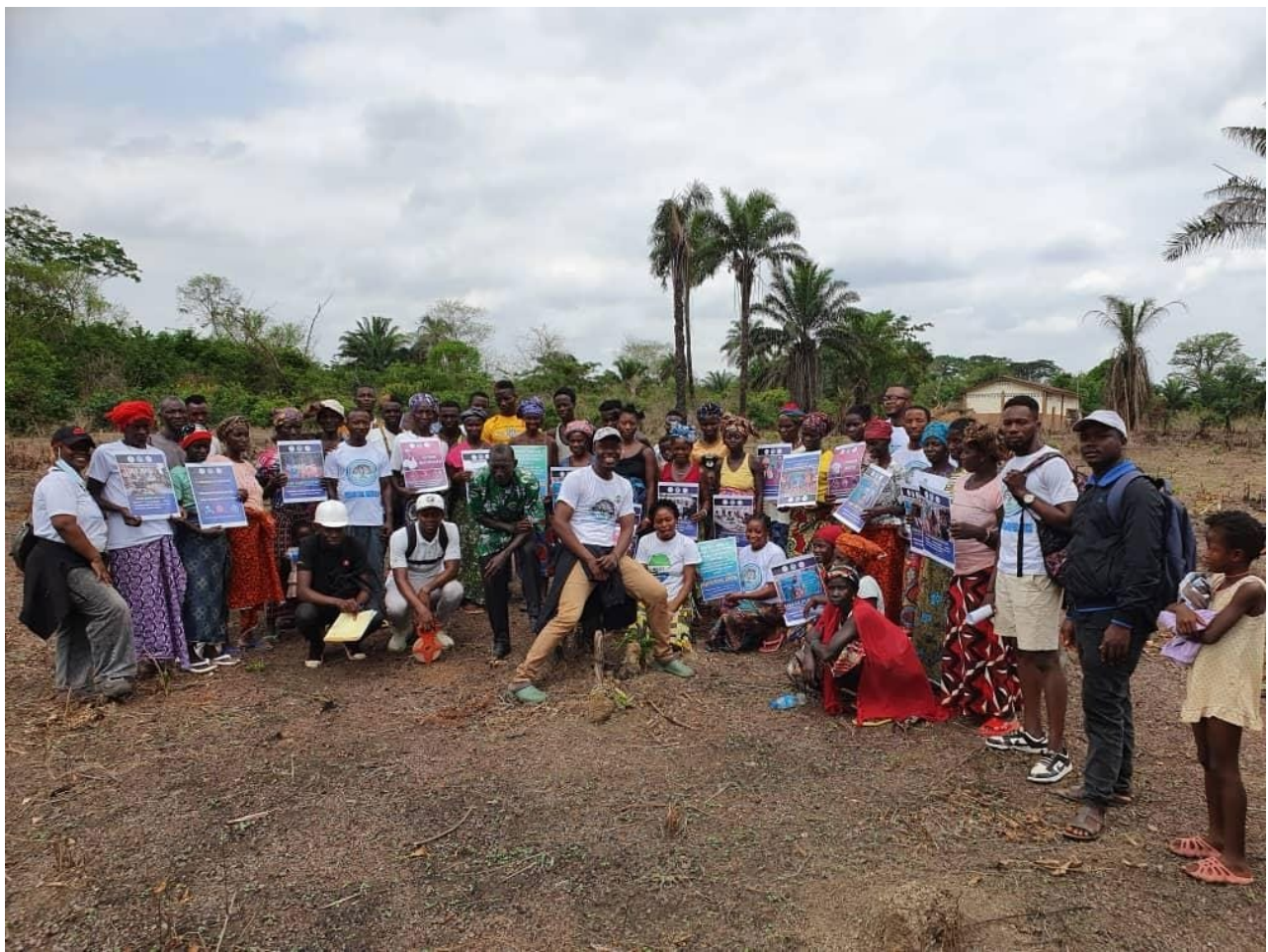
Impact Sierra Leone volunteers with the women farmers on the future site of the Impact Vocational Training Center for women farmers – Site Visit – April 5, 2025