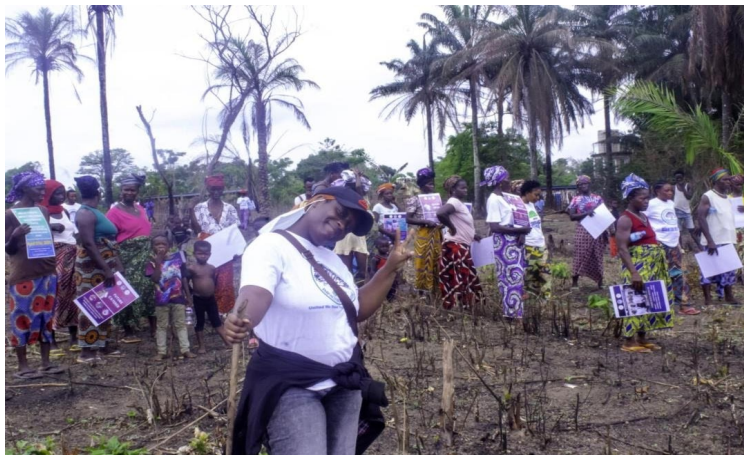
The engineer is taking land measurements below with the women standing. Above are the women and volunteers