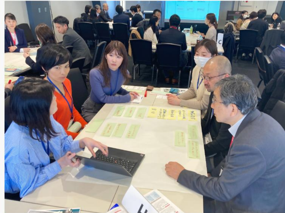
"Private sector x NGOs Meetup" where opinions were exchanged on cooperation during domestic disasters