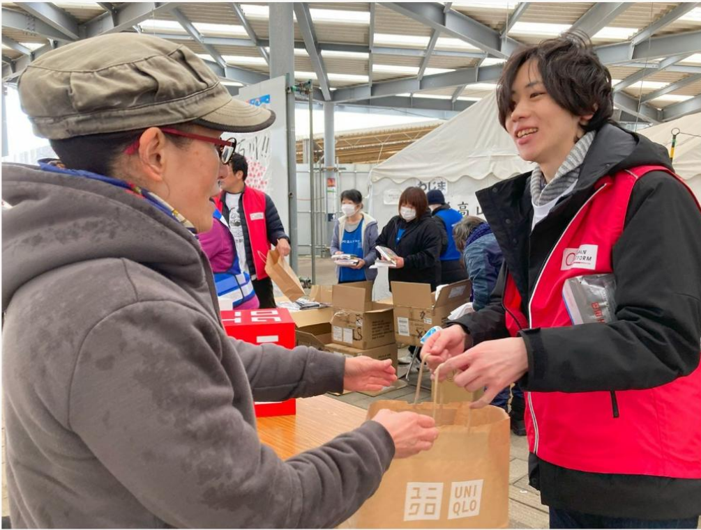
Many people gathered at the Events to deliver HEATTECH / Wajima City / 2024.12.15