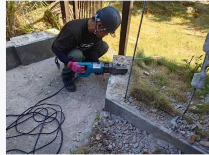
Repairing a damaged house by a technical NPO