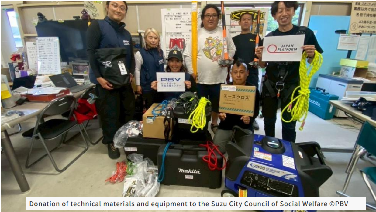
Donation of technical materials and equipment to the Suzu City Council of Social Welfare