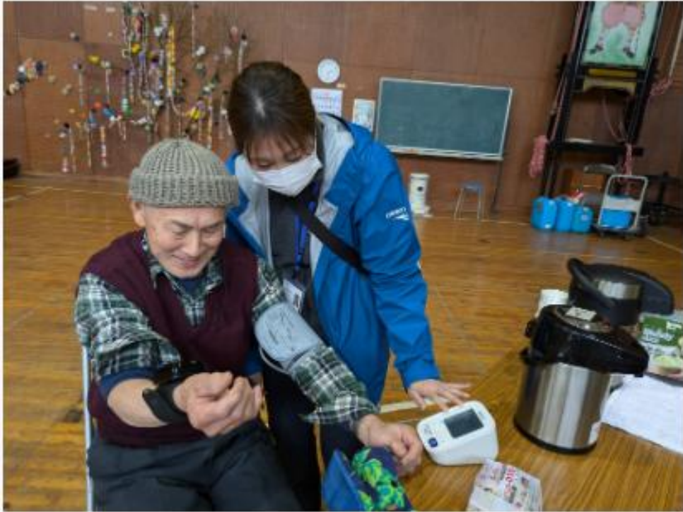
Health counseling at a community meeting place / Suzu City, Ishikawa Prefecture