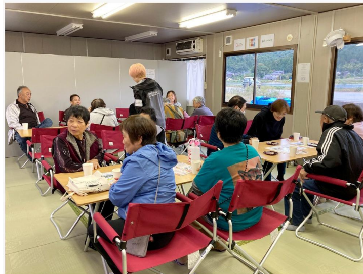
People gathering at Machinoma / Machino-cho, Wajima City, Ishikawa Prefecture / October 21, 2025

PBV and JPF will continue to support the community while carefully listening to its changing needs.