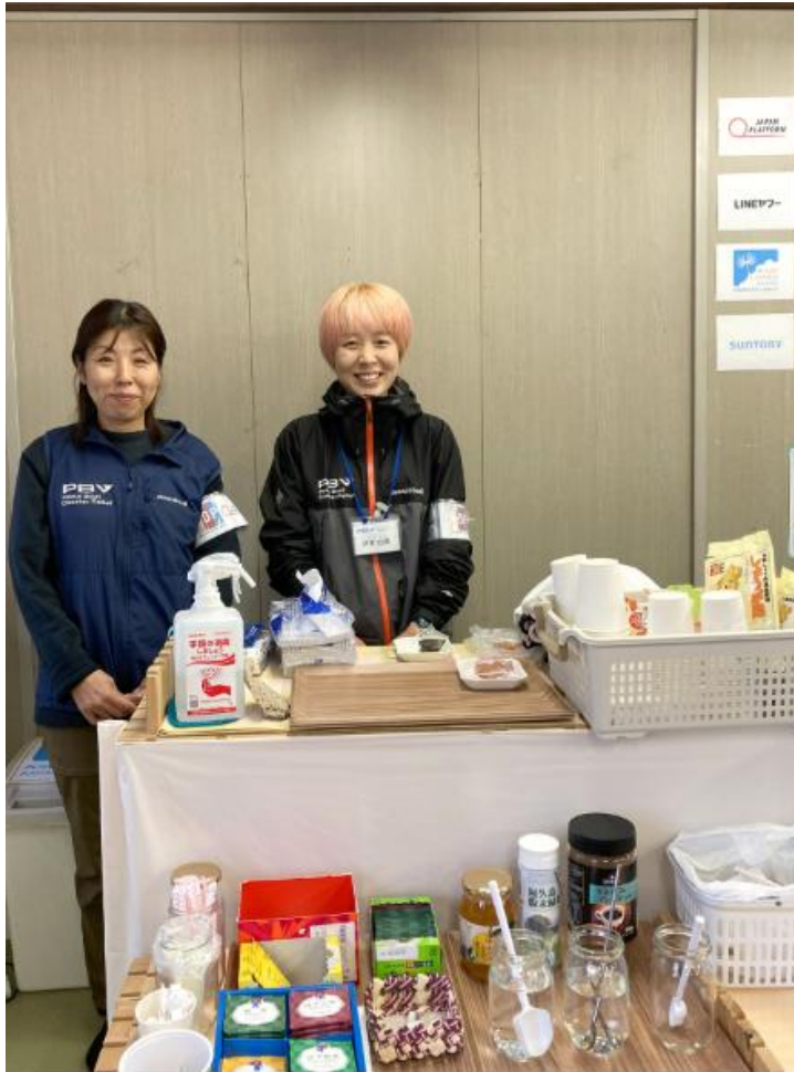
Machinoma" staff members / Machino-cho, Wajima City, Ishikawa Prefecture / 2025.10.21