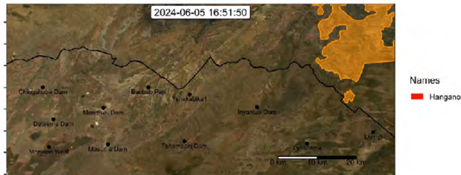
WildCRU lion movements