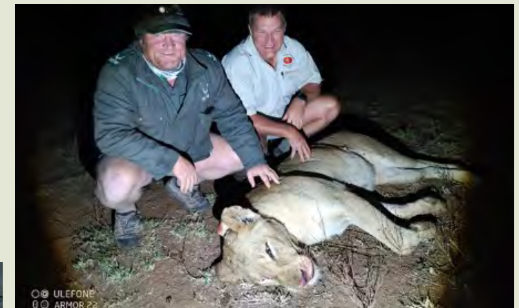
Collar 8677 fitted at Tshokwane.