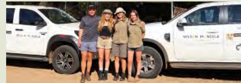
Our dedicated lion-counters in Kruger National Park. Two teams covered 25000 kms over 114 days, indentifying over 300 lions.