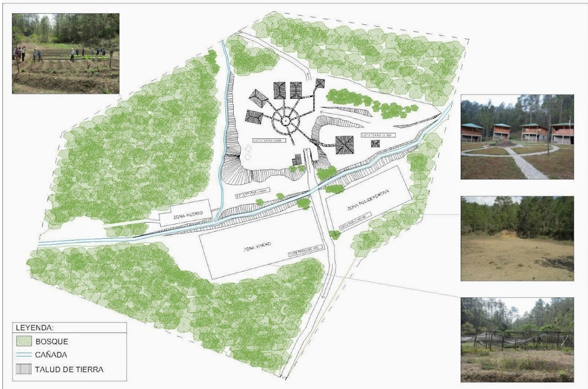
Legend of Educational Center Vocational Aventura