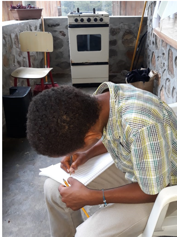
Student at the Educational Aventura