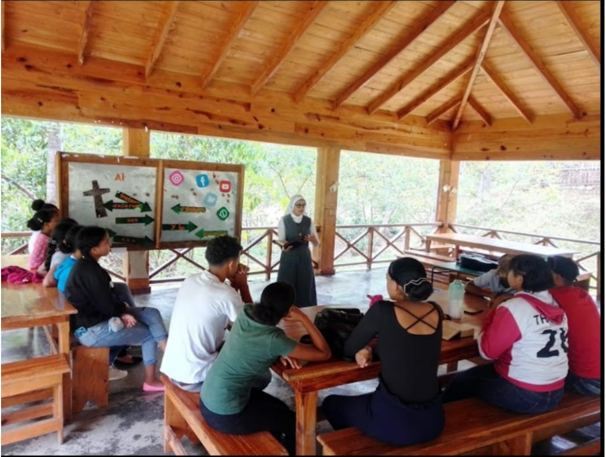
Educational Center Vocational Aventura