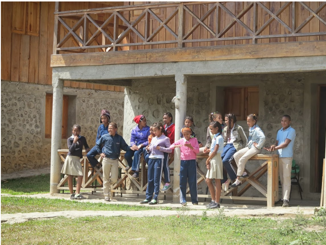
Group of students at Educational Center Vocational Aventura