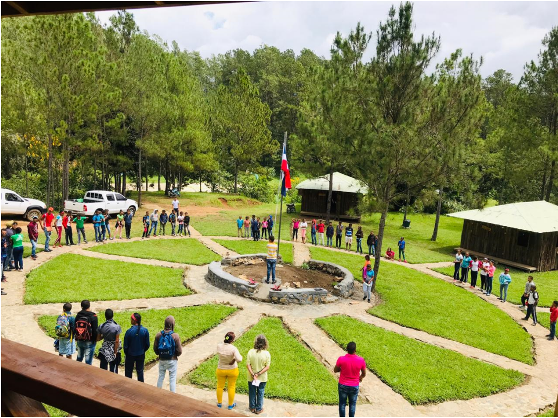
Educational Center Vocational Aventura