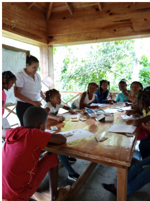
Students at the Educational Aventura