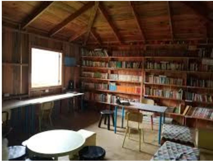
Resource of 6 libraries equipped in collaboration with the Corazonistas Foundation.