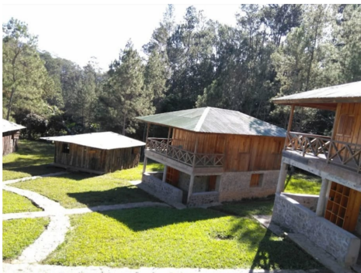
Bedroom area of Aventura School. The construction of Aventura Espejo School is a replica of this school in operation since 2012