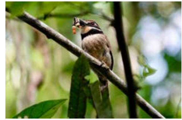
Chestnut-capped puffbird Bucco macrodactylus