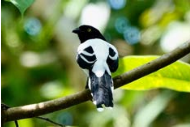
Magpie Tanager Cissopis leverianus