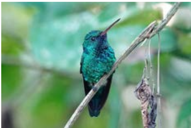
Blue-tailed Emerald Chlorostilbon mellisugus