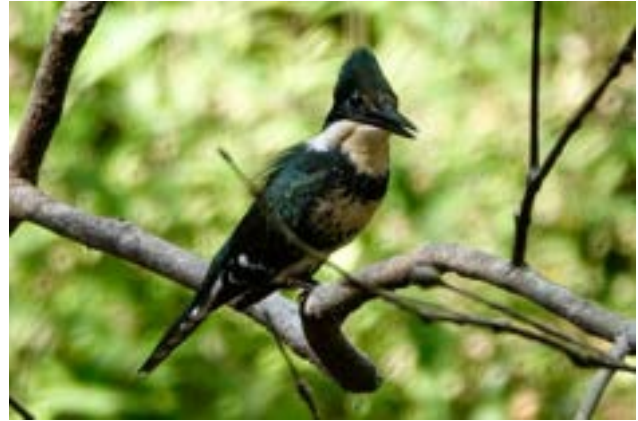
Amazon kingfisher Chloroceryle amazona