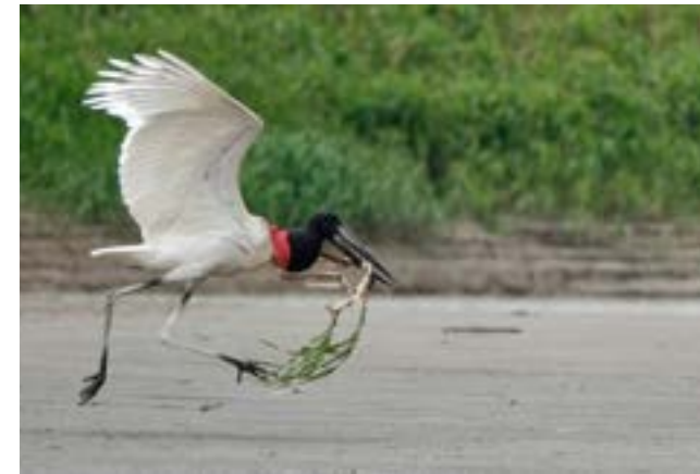
Jabiru Jabiru mycteria