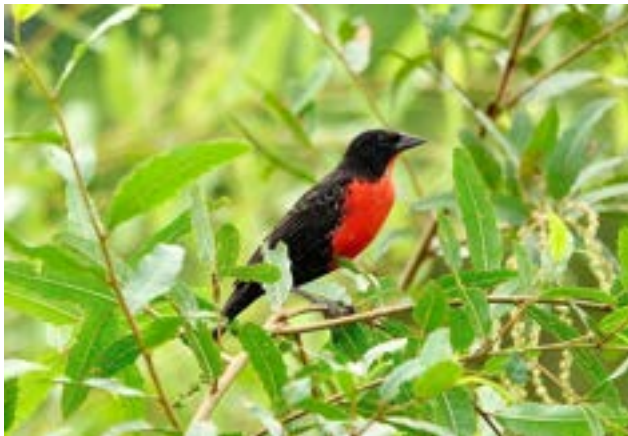
Red-breasted Meadowlark Leistes militaris