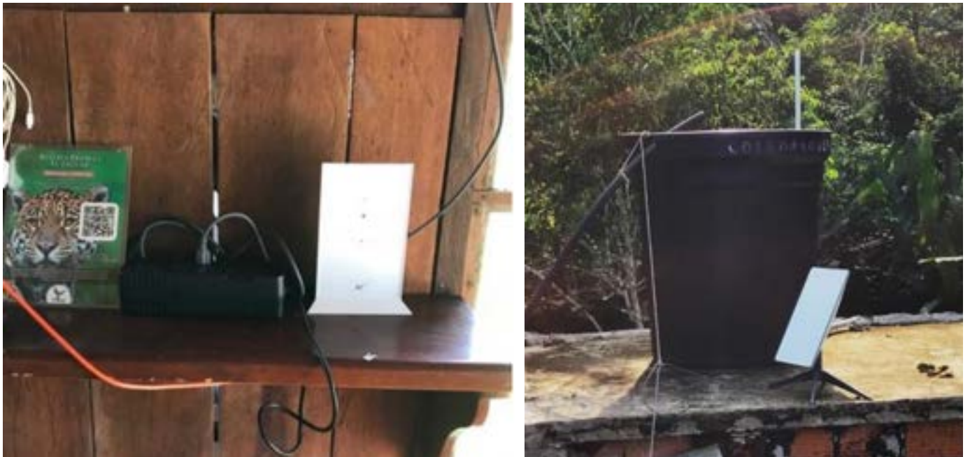
Left and Right: Starlink kit set up including router and antenna.