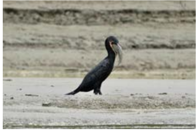
Neotropic cormorant Nannopterum brasilianum