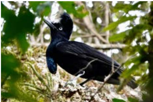
Amazonian umbrellabird Cephalopterus ornatus