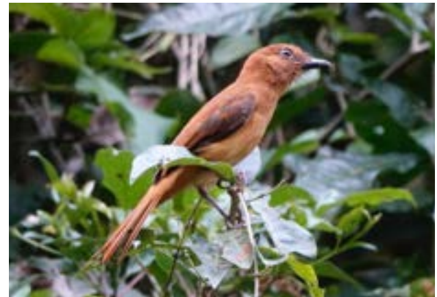
Cinnamon Attila Attila cinnamomeus