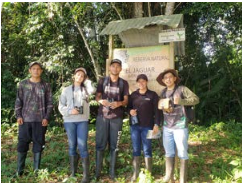
Jiw Community School bird identification workshop (left) and Institución Educativa Jorge Eliécer Gaitán birdwatching workshop (left).