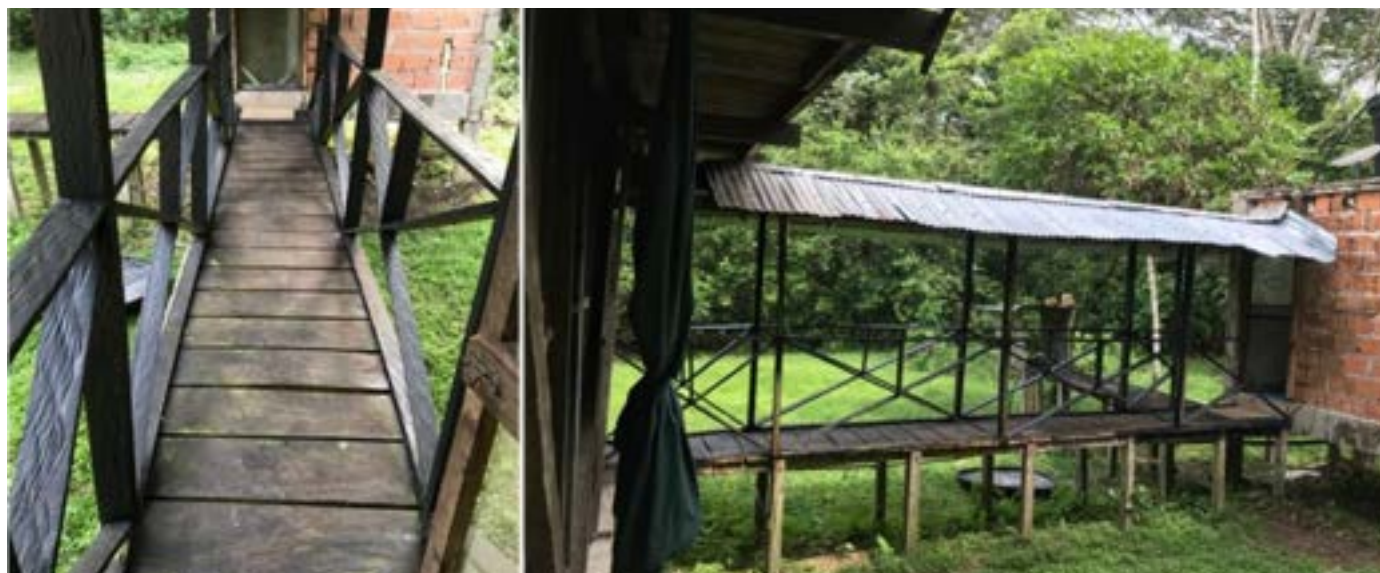
Left and Right: The walkway between the kitchen and the bathroom was improved and renovated due to damage from the rainy season.