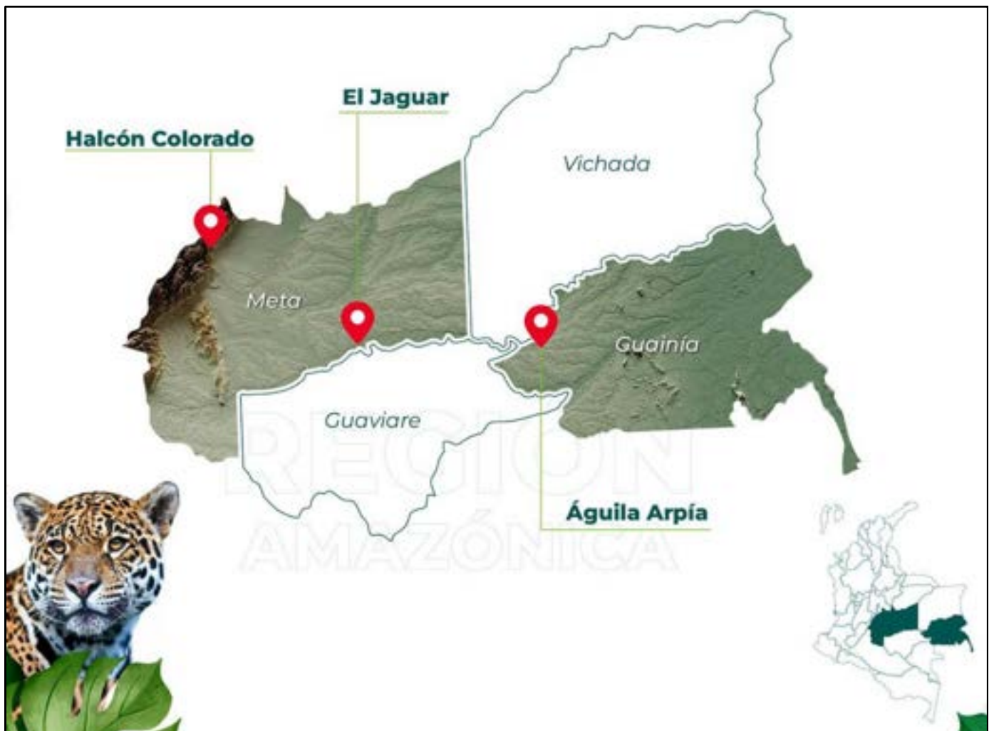
Map demonstrating the location of the El Jaguar Research Station on the Rio Guaviare.

Our project site is located in the El Jaguar Nature Reserve, about four hours downstream from the gateway city, San José del Guaviare. The closest town, Mapiripán, is located 25 minutes by motorboat from El Jaguar. The main means of transportation along the river is by small boat, although materials can also be transported from San José del Guaviare to Mapiripán (3 hours), and another 25 minutes by boat to the nature reserve. Visiting researchers and guests can fly into Villavicencio and arrive by small plane, or take an 8-hour bus to Mapiripán. They can also fly in to San José del Guaviare and take a four hour motorboat or three hour car ride to Mapiripán. The main form of transportation for receiving visitors, visiting Mapiripán, and observing birds along the river bank is by motorized boat. The small port of Mapiripán is a 25 minute boat ride upstream from the El Jaguar Nature Reserve.