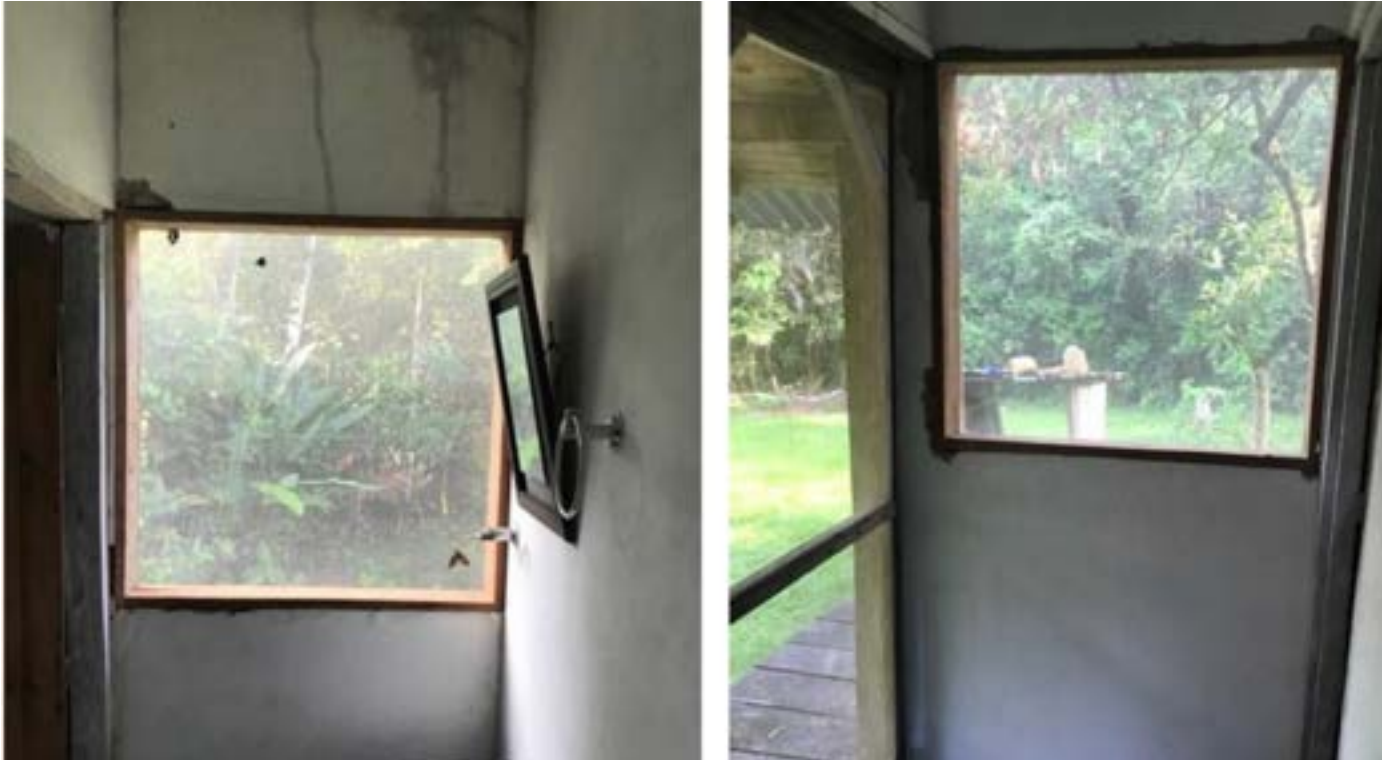
Left and Right: Updated frames and mosquito netting for bathroom windows.