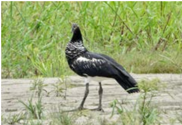
Horned screamer Anhima cornuta