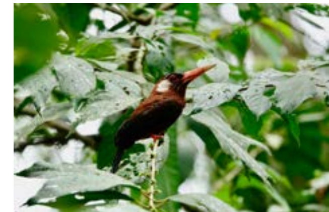
White-eared Jacamar Galbalcyrhynchus leucotis