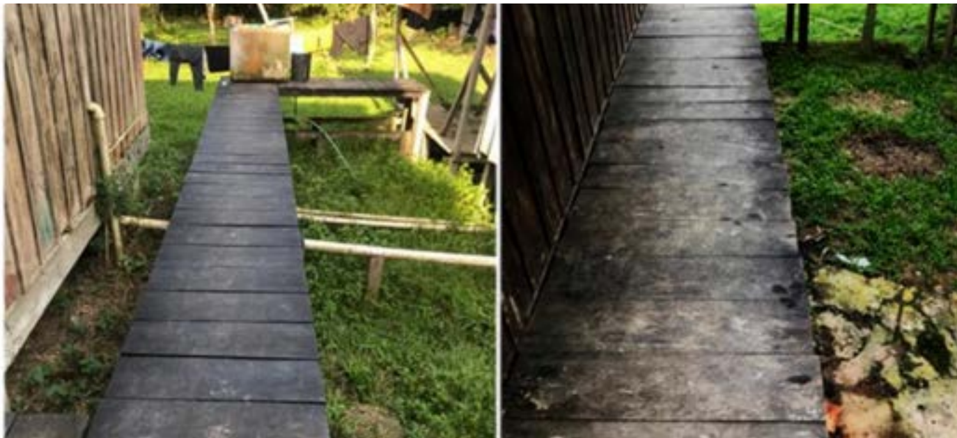
Left and Right: New wooden walkways were installed from the kitchen to the laundry area and from the Forest Guard's house to the kitchen and laundry area.