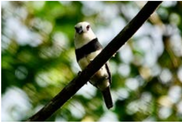
White-necked puffbird Notharchus hyperrhynchus