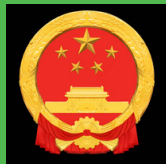
Chinese Embassy in Zambia