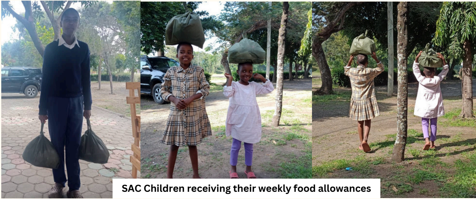
SAC Children receiving their weekly food allowances

We are ecstatic to share the incredible progress of our food program with you! Because of your generous monthly sponsorship, we are able to feed more and more children, ensuring they receive the nutrition they need to thrive.