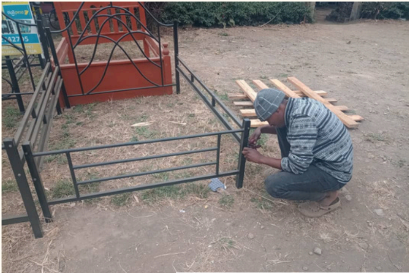
Buying beds for the girls