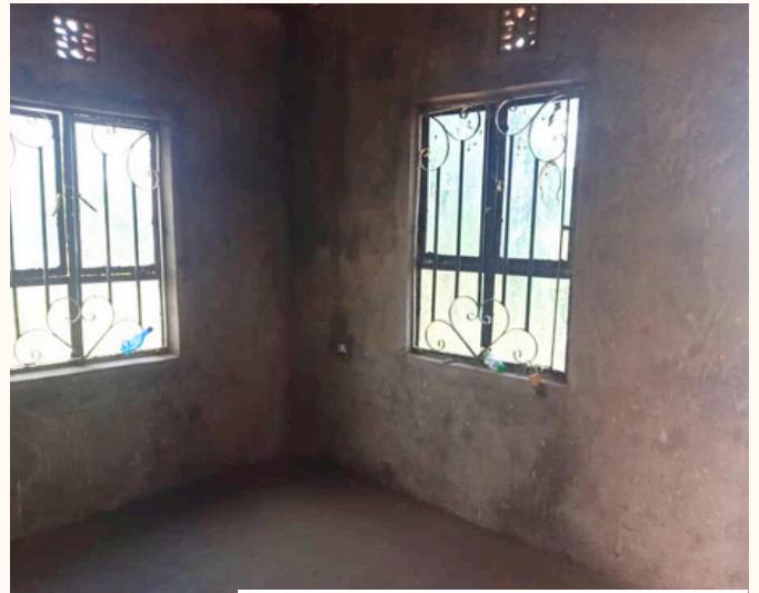
The plaster and cement is drying