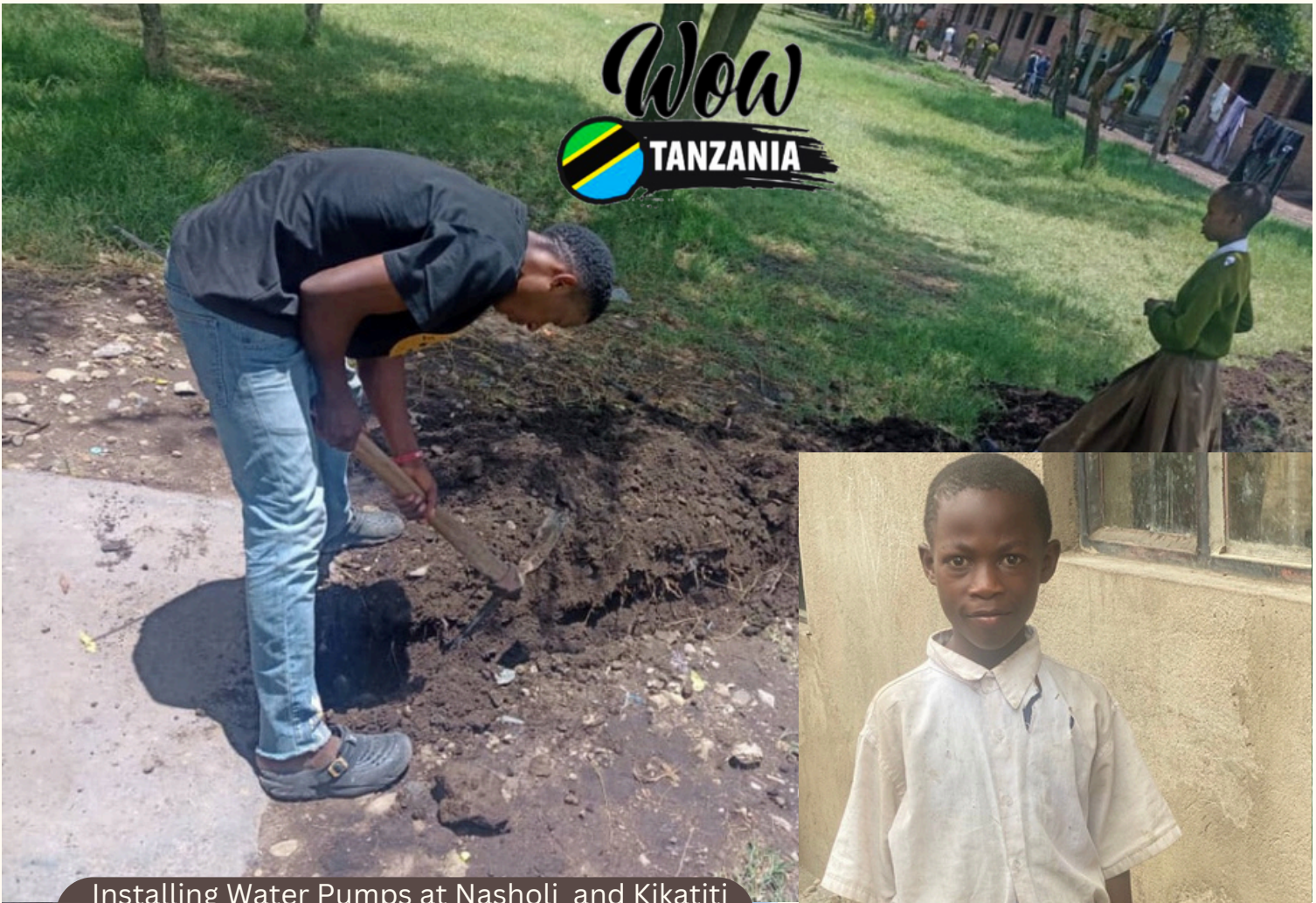
Installing Water Pumps at Nasholi and Kikatiti Primary