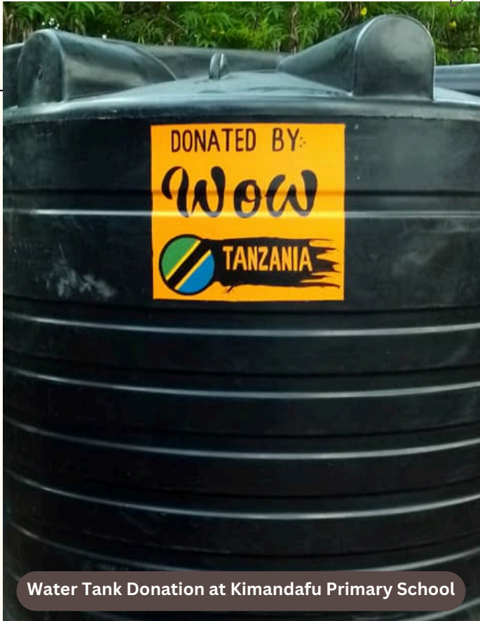
Water Tank Donation at Kimandafu Primary School

We're thrilled to announce the completion of our WASH (Water, Sanitation, and Hygiene) project this week! Despite our grant funding being cut in half by the Trump administration—specifically Senator Marco Rubio—we pressed on, and thanks to your unwavering support, four schools now have access to clean water! We installed 3 water tanks, dug 2 wells with water pumps, added 2 rainwater harvesting systems, and set up 10 water taps for the children's handwashing. The schools benefiting from this initiative include Kimandafu Primary, Nasholi Primary and Secondary, and Kikatiti Primary.