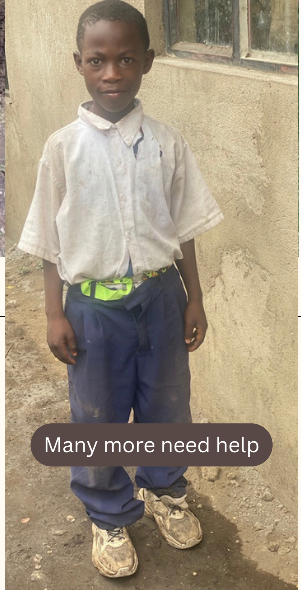
Many more need help

Please see and share all our contact information below. Thank you for partnering with us on this incredible journey. Together, we are making a lasting difference in the lives of these children and their families.