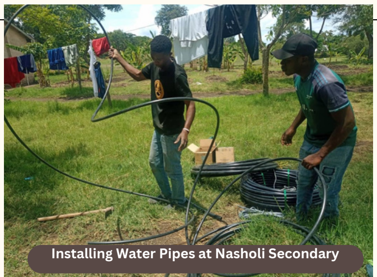
Installing Water Pipes at Nasholi Secondary

Although we're disappointed we couldn't install more tanks or provide water filters due to the budget cut, we've applied for more grants and are hopeful that, with additional funding, we can finish what we started.