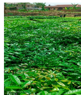
1.3 Baby forest trees in the forest nursery

At a recommended spacing of 3m by 3m, we have secured 15,000 out of the 18,331 forest seedlings needed for planting. We still require your support to procure the remaining seedlings and additional ones for replacement operations, estimated at $2,000 .