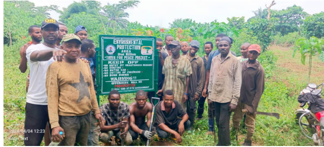
1.4 Our beloved workers on site

In recognition of our efforts and the government's commitment to the project, Edo State Governor Mr. Godwin Obaseki has declared our Forest Regenerated Area an Environmental Protection Area. This ensures that the forest trees, wildlife, and other fauna are protected by law. Signposts have been placed in strategic areas to inform the public of this development, marking a first in Edo State.