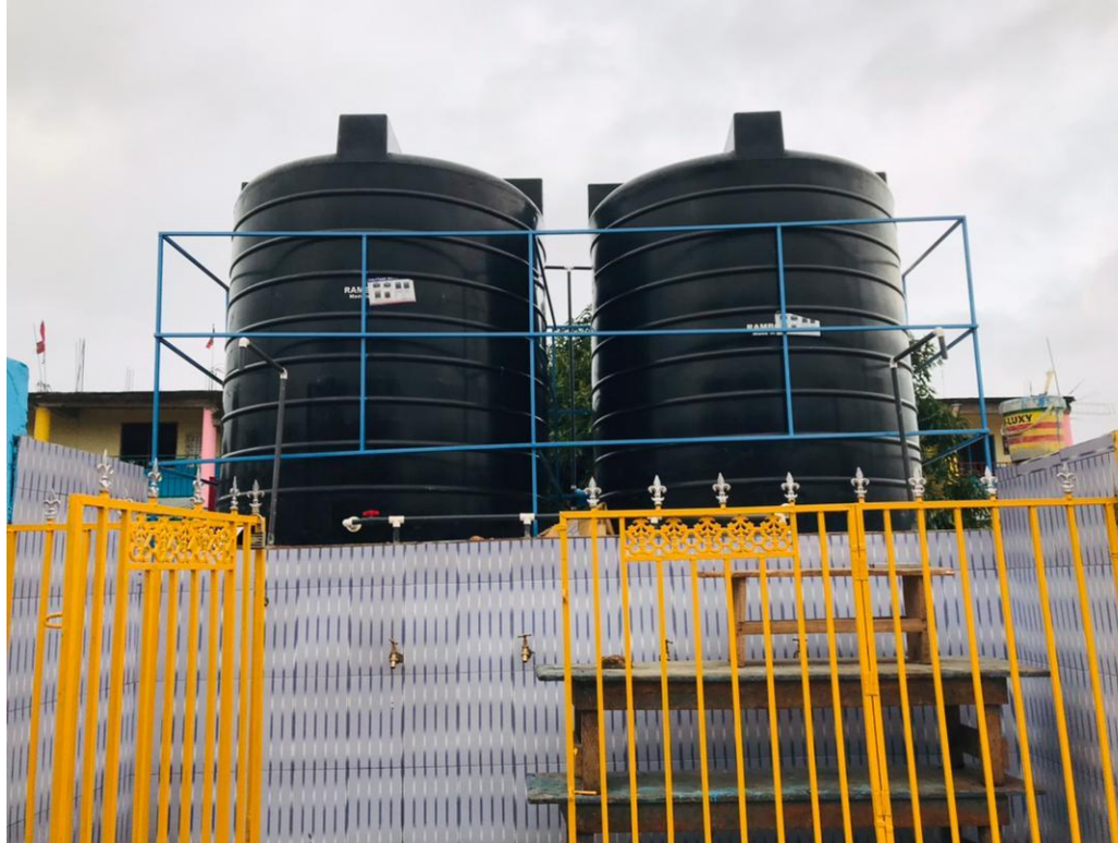
Water project in Youth For Change Educational Center and Asuofua Community at completion stage