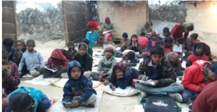
Photo 3: Peace4Dalits Foundation Nepal's Founder is a teacher concerns the socially backwards of Parsa District, close to the Bihar state of India.

As an Executive focusing on social initiatives, I figured out that one important aspect that is driving Console Mission, in relation the initiative to motivate children and their parents as a whole community, is linked to what is said in Ecclesiastes 7:12 "For wisdom is a defense as money is a defense, but the excellence of knowledge is that wisdom gives life to those who have it." And in Proverbs 16:16 we can find, "How much better to get wisdom than gold! And to get understanding is to be chosen rather than silver". Wisdom and understanding are the 2 words that I found relate to the objective of OSP, an initiative that will certainly help sustain the progressive development of the Nepalese community, starting from the targeted villages.