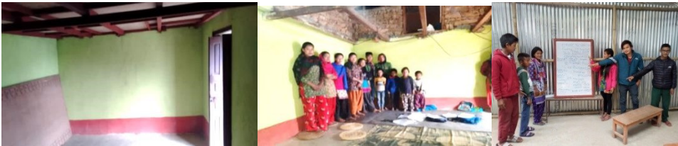
Photo 2: OSP at Choughare Village recently hired for a year. In March 2021 the personnel visited, the room was incomplete. Console Mission invested by financially assisting to fix the roof. And, in 2018, student of Choughare learning in temporary house during earthquake.

local people start coming together, serious about the future of their children children from grade 8, 9 and 10 understand that they can play a positive role in the progressive improvement of their community children become thoughtful about their career plans: what they will do as adults and what subjects they need to focus on easily managing community activities like treating disease, and prevention of transferable diseases.