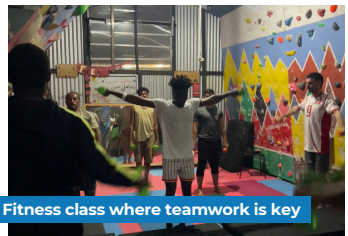
Fitness class where teamwork is key