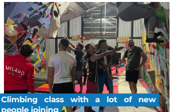
Climbing class with a lot of new people joining

Besides the events and highlights, we continued with our regular classes, volleyball, fitness, climbing, MMA, and bodybuilding. As well as our woman-only classes: fitness and climbing.