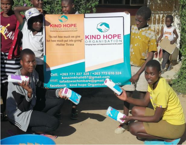
Donate a pad campaign