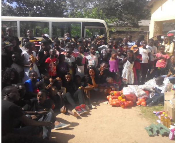
Provision of food and stationery items