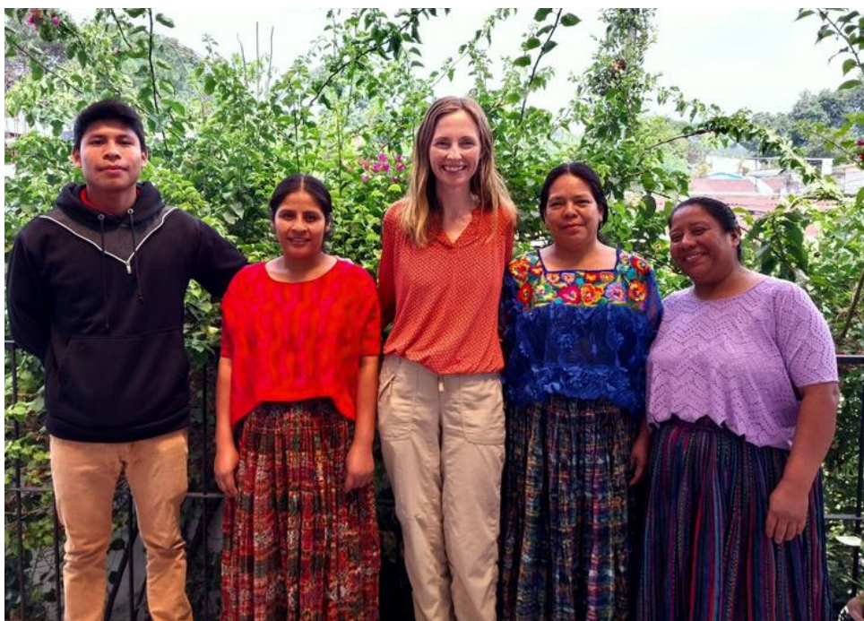
Above: Level 1 course attendees pictured with CasaSito team members.