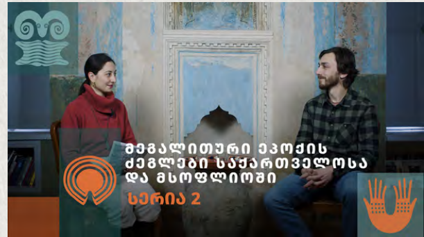
Episode 2-Monuments of megalith era in Georgia and in the world