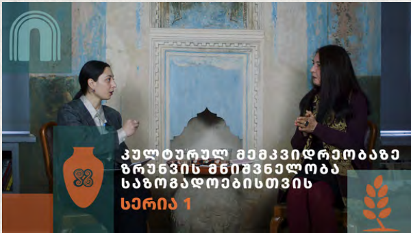
Episode 1-The importance of preserving cultural heritage for society

This project marked the NTG’s first attempt to raise awareness through the podcast format, aiming to engage a broad audience in cultural heritage issues and encourage active participation in its preservation and development. The podcast series can be found on NTG’s YouTube channel.