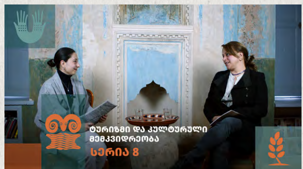
Episode 8-Tourism and cultural heritage