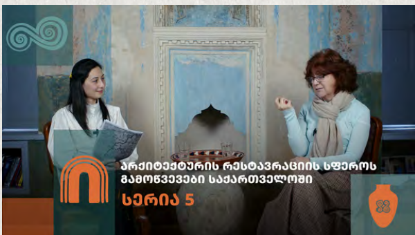
Episode 5-The challenges of the architecture restoration sphere in Georgia