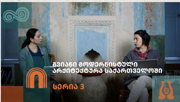
Episode 3-Late modernistic architecture in Georgia