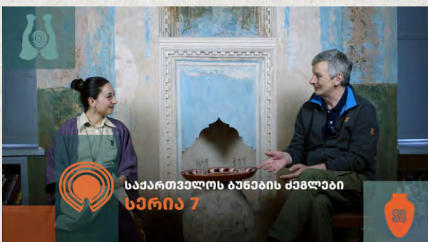
Episode 7-Natural monuments of Georgia