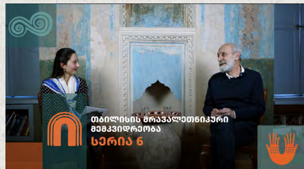
Episode 6-Multiethnic heritage of Tbilisi