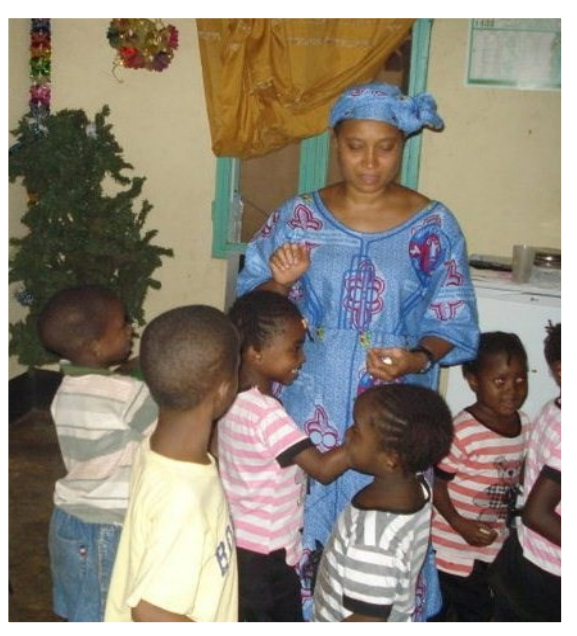
July 2011 visit

means that by sending just 10% more girls to school on a yearly basis, Mali can maintain healthy economic growth. We currently have twelve children: six boys and six girls.