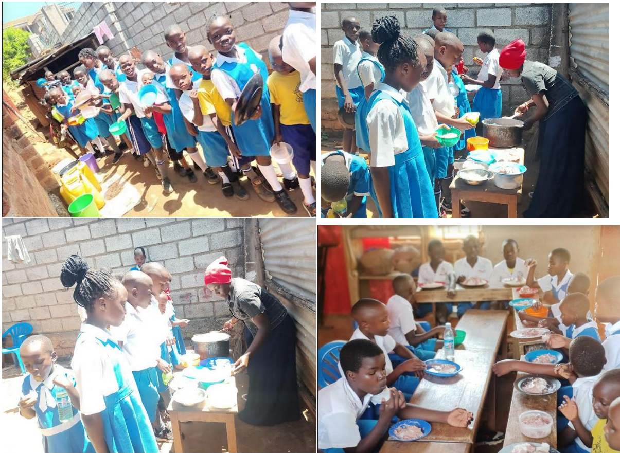
Education status (some Students in classroom)