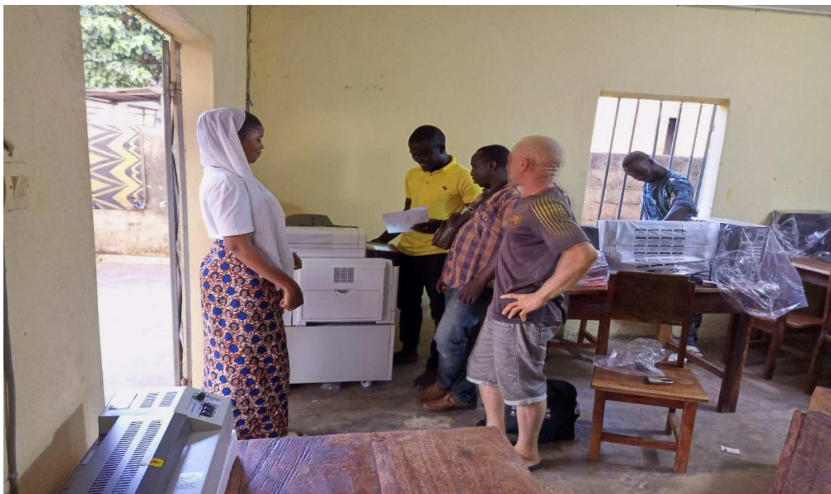
First customers for photocopying even before installation is complete