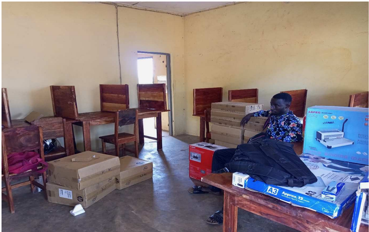
View of the furniture made