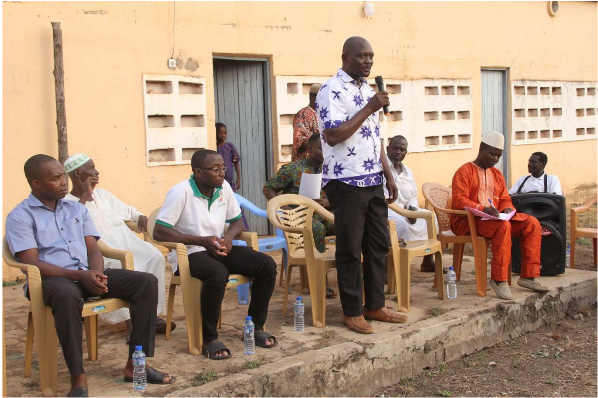
The High School Censor addressing the participants