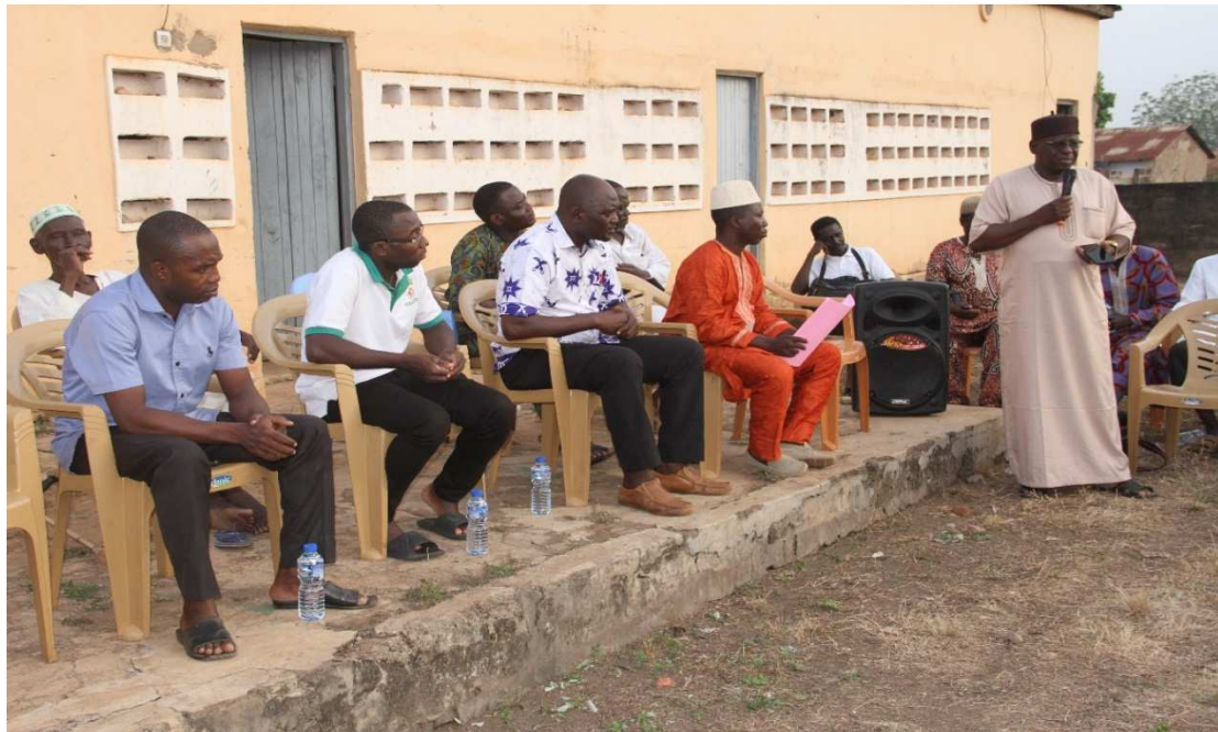
The Coordinator of the NGO CAV addressing the participants