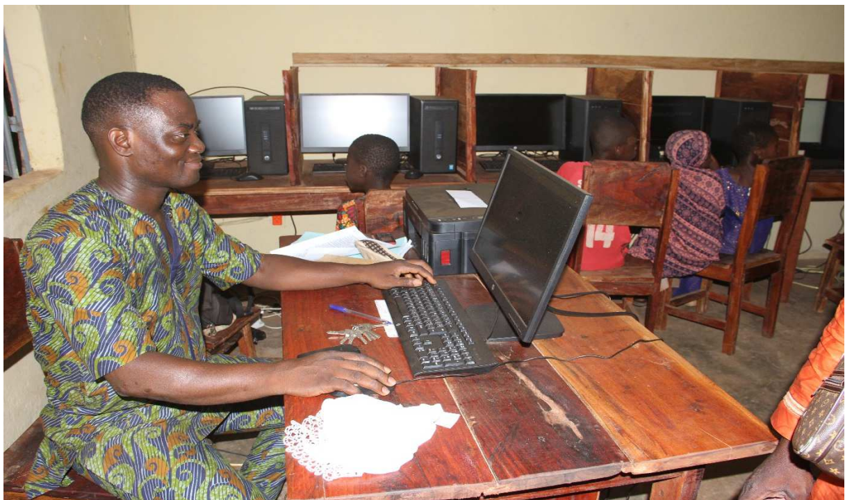
View from the Cyber Director