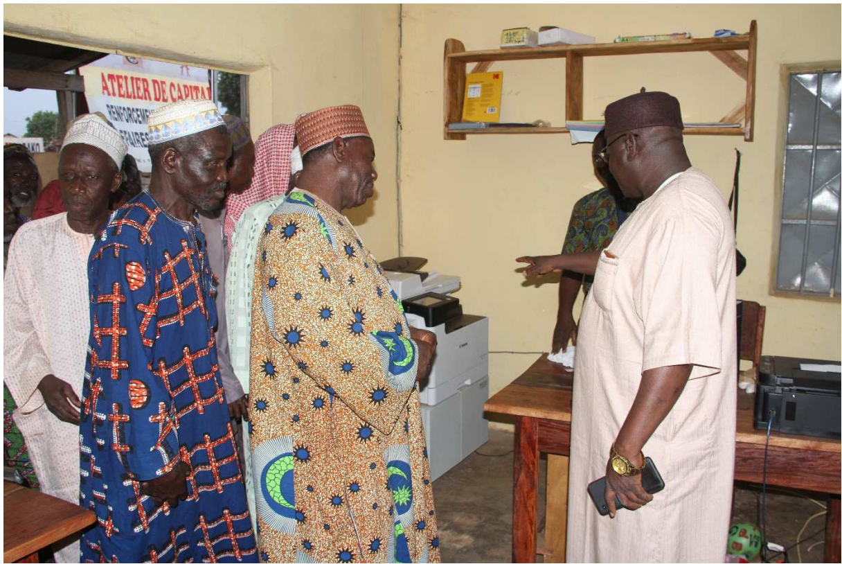
Visit of services