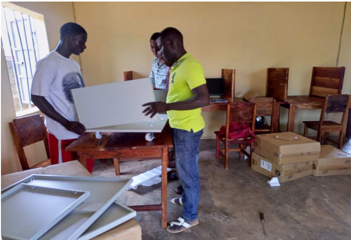
Mounting the photocopier