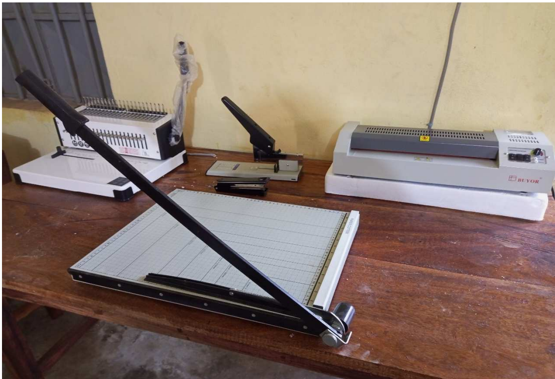
View of binding materials, staplers, lamination and cutting blade