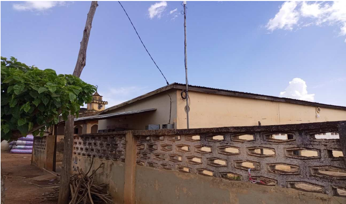
House housing the Cybercafé