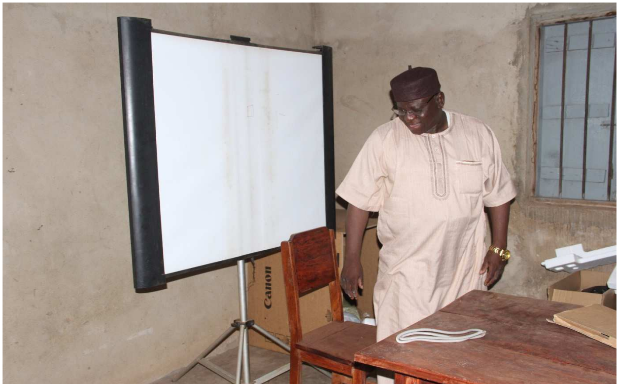
View of the photography room