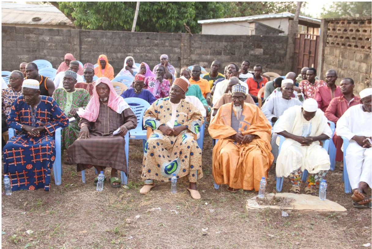
View of the Canton Chief and participants at the project launch