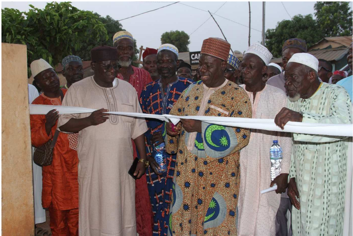
Cutting of the symbolic ribbon by the Chief of the canton