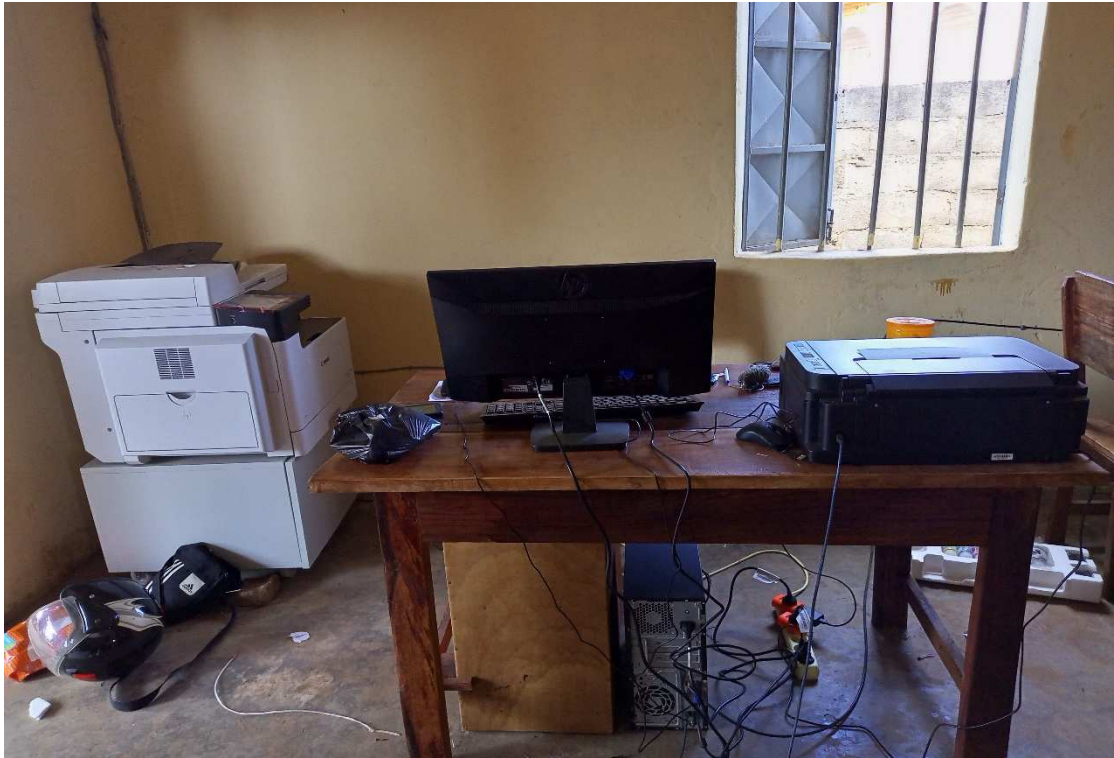
View of photocopier, secretary's computer and printer