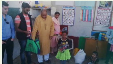
Parents Teacher Meeting!!