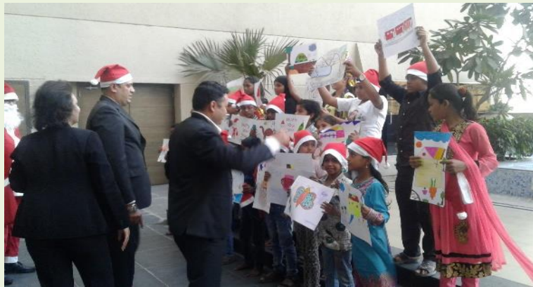
Food Packet Distribution!