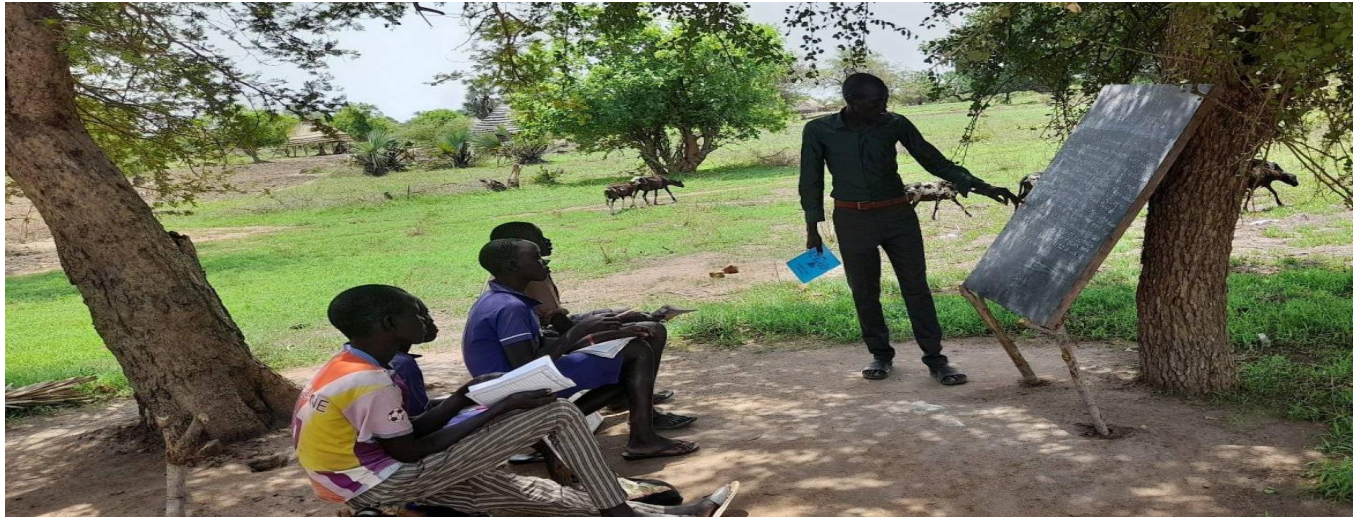
Primary five attending classes under tree.