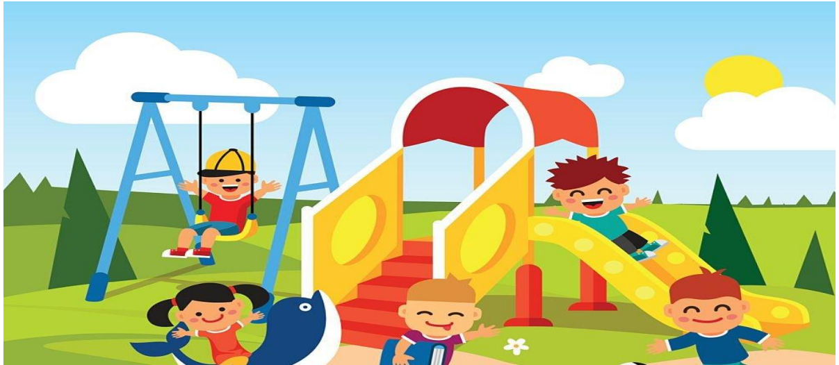
Kids Playground at Deng Maker Primary School by 2027