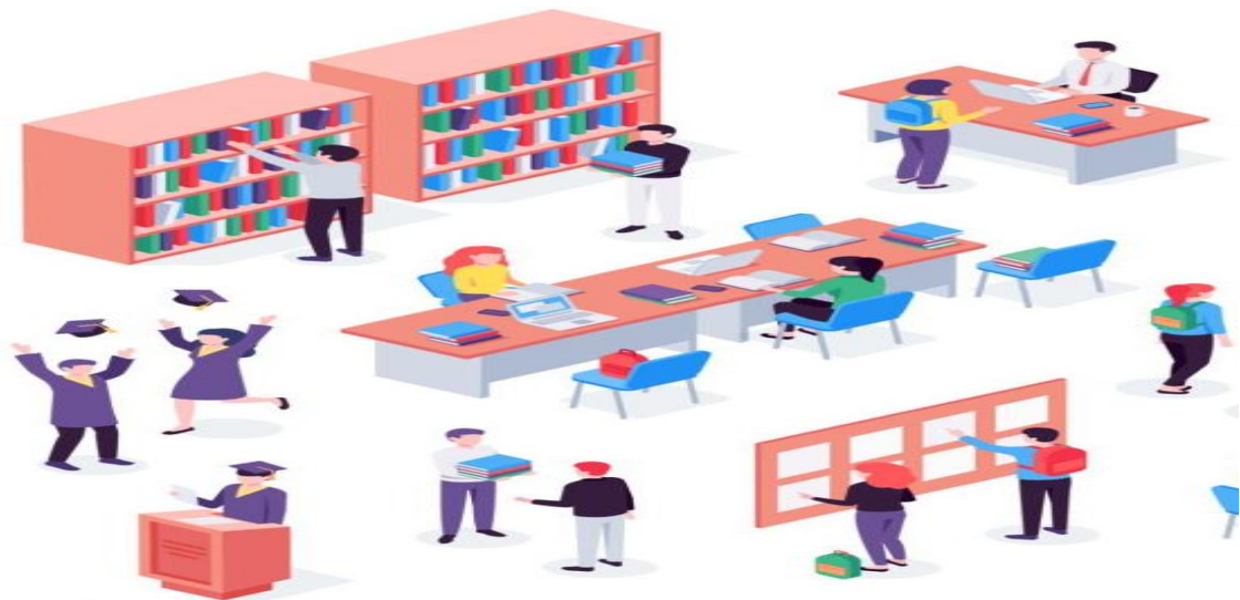
Both digital and offline library at Deng Maker Primary School

We would like to construct modern classrooms, latrines, labs and introduce digital library to our students, pupils and teachers. for us to be able to provide conducive environment for learning, we need support from generous donors through GlobalGiving platform so that we can construct classrooms, latrines, solar torches, and incentives for teachers at Deng Maker Primary School.